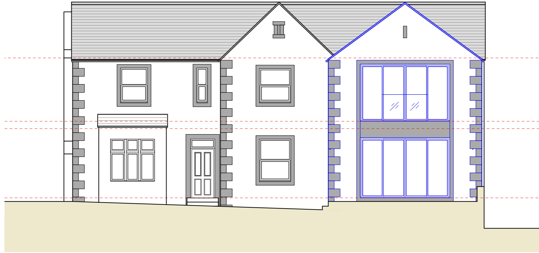
3 ELEVATIONS - PROPOSED SIDE A SCALE 1:100 @ A3