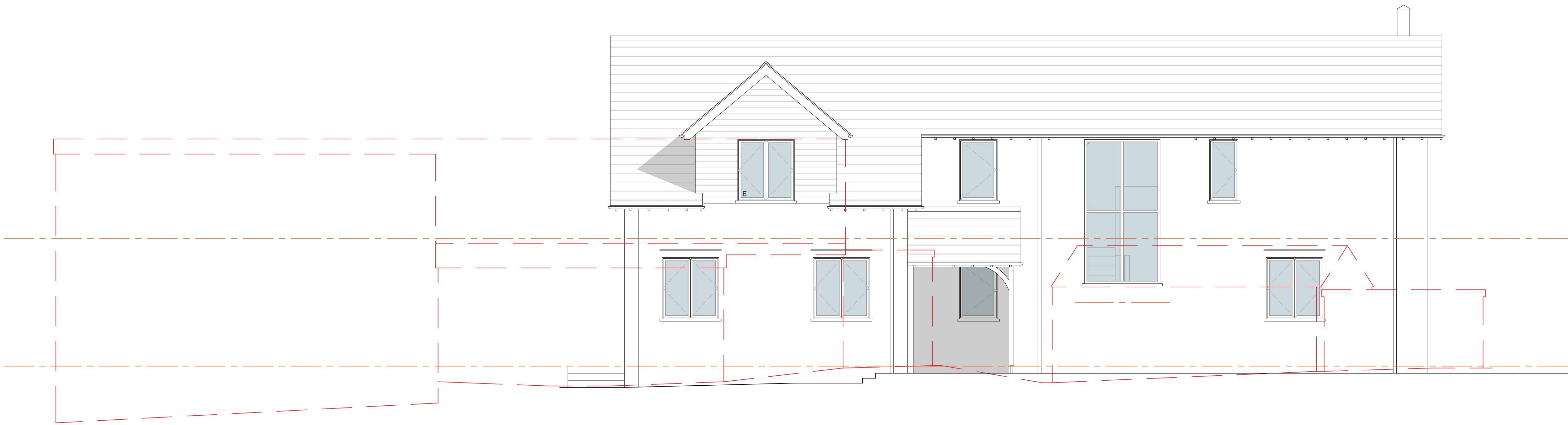
Proposed Northwest Elevation Scale 1:50