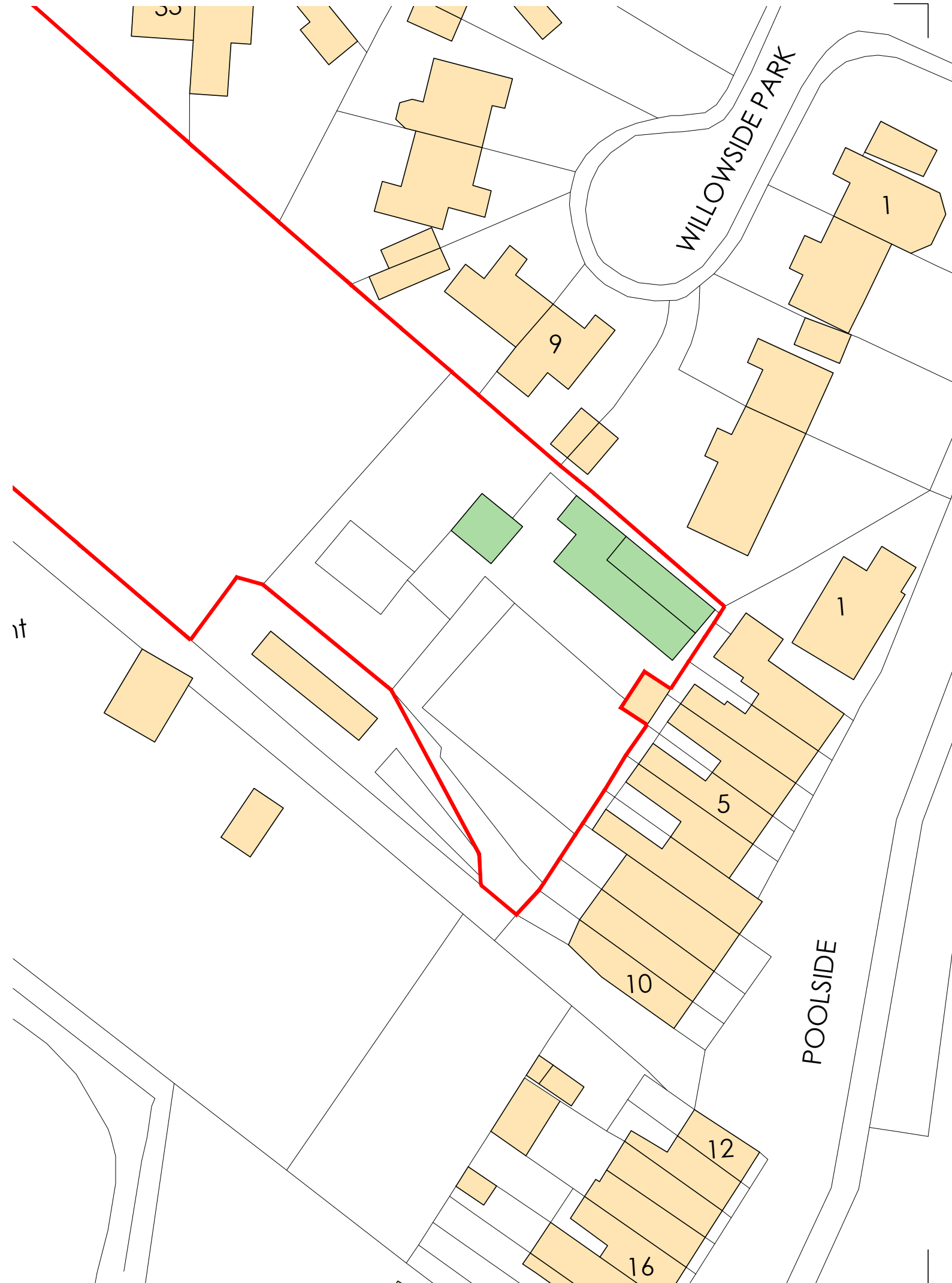
BLOCK PLAN @ 1:500 ▷