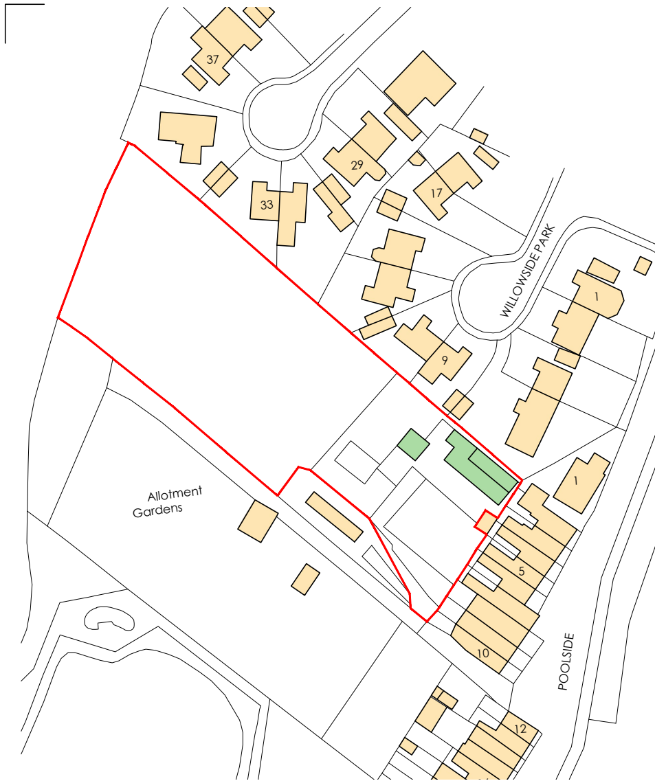
LOCATION PLAN @ 1:1250 △