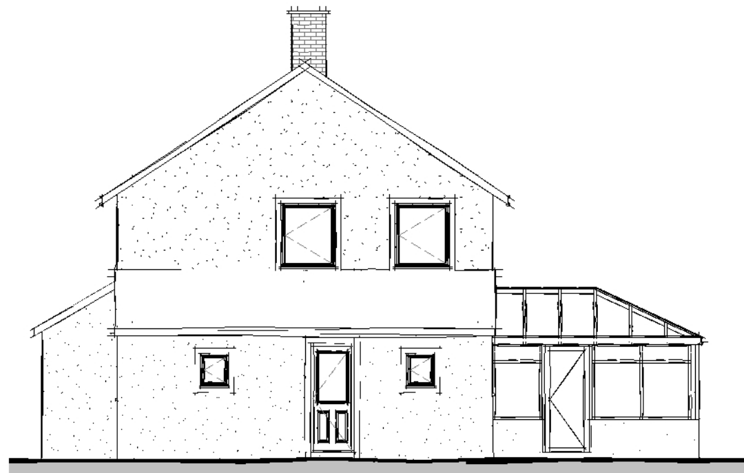
Side Elevation 01