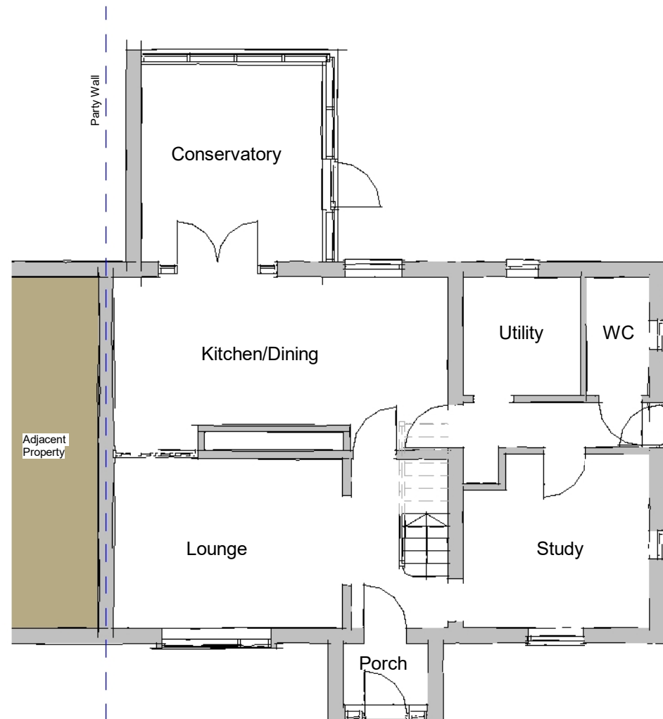
Ground 1 : 100