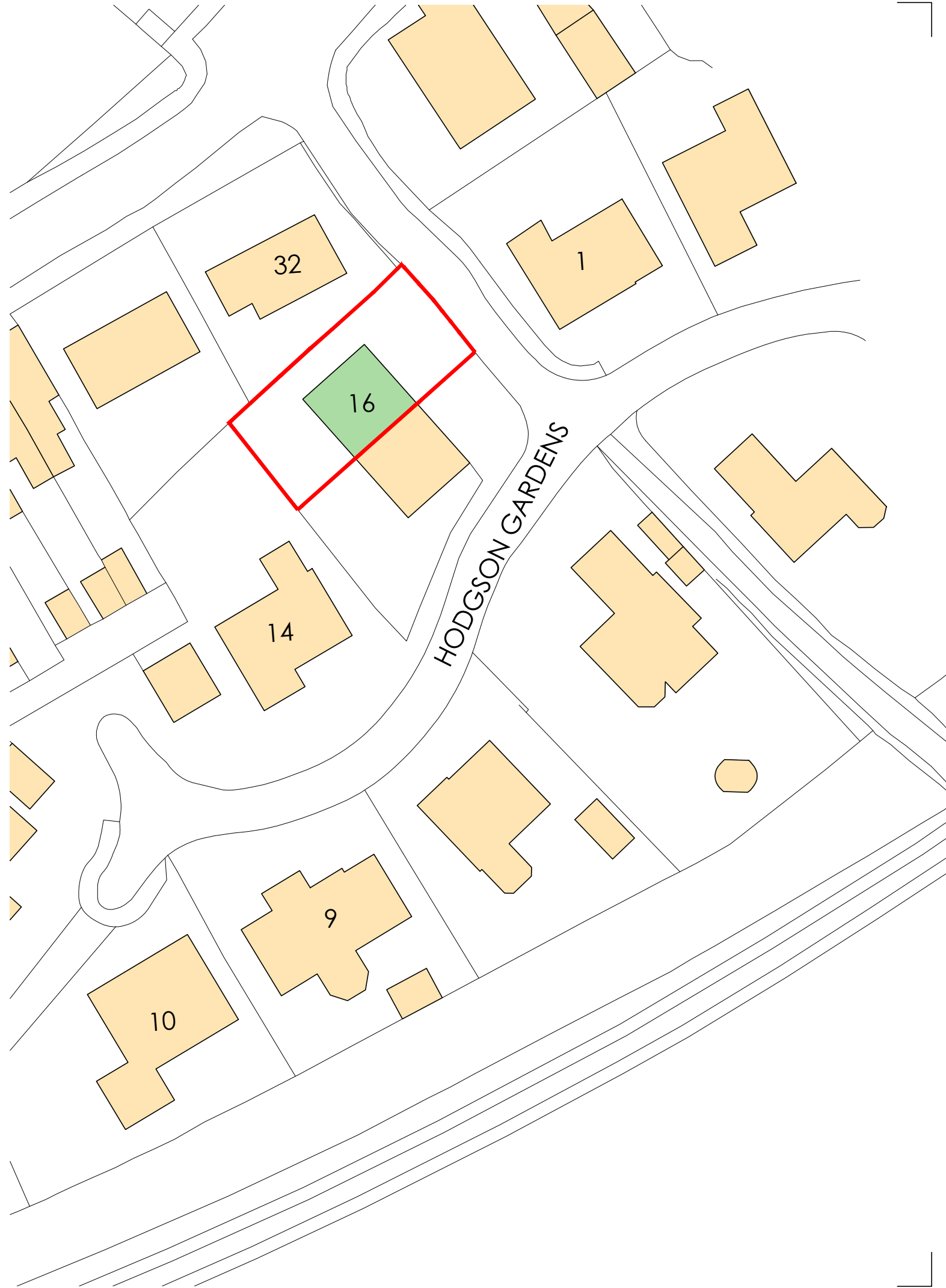
BLOCK PLAN @ 1:500