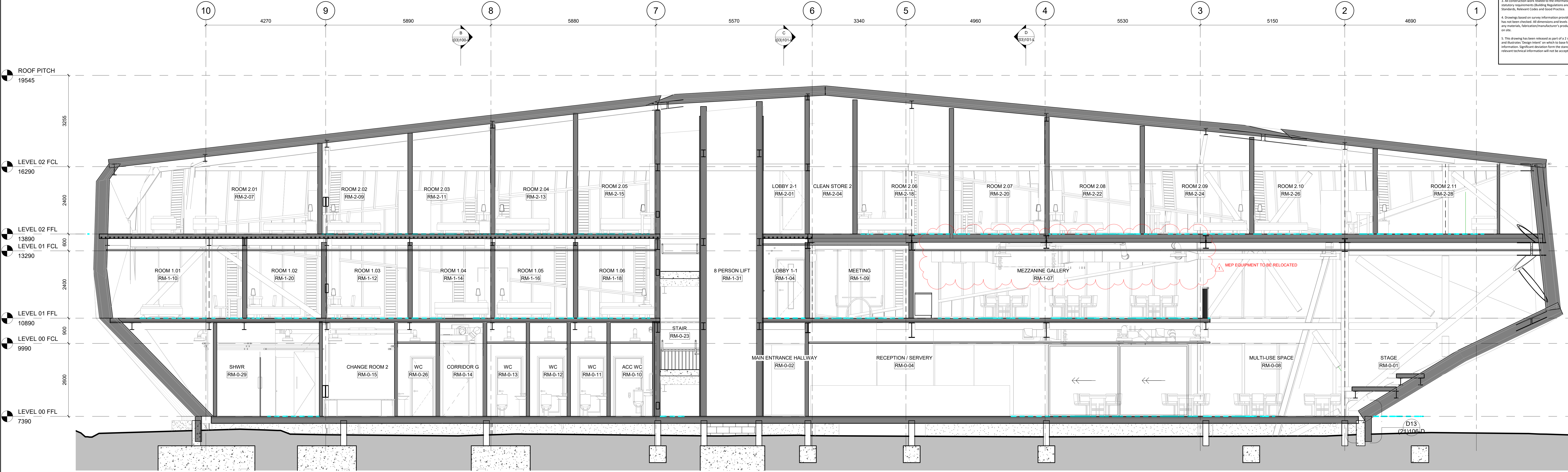
A SECTION AA 1: 50