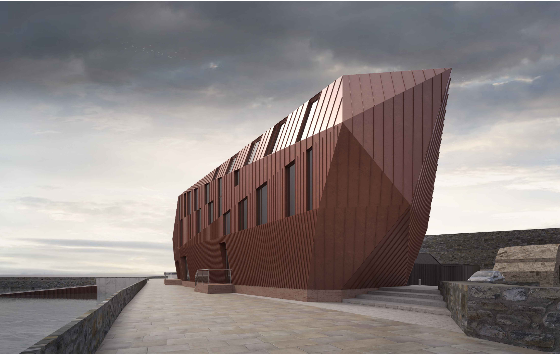
KEY VIEW 7