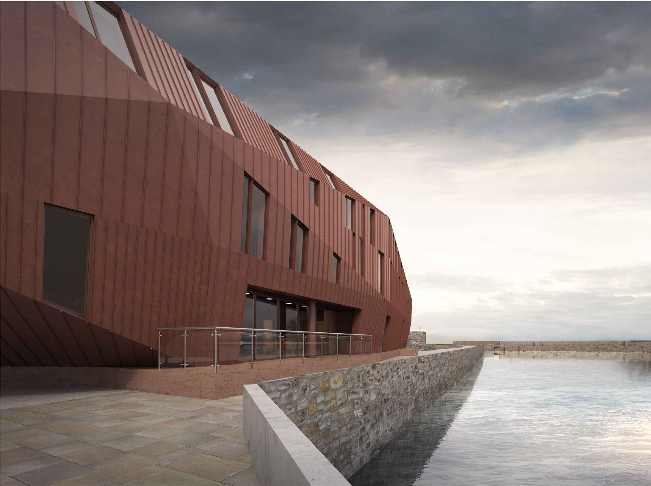
KEY VIEW 6