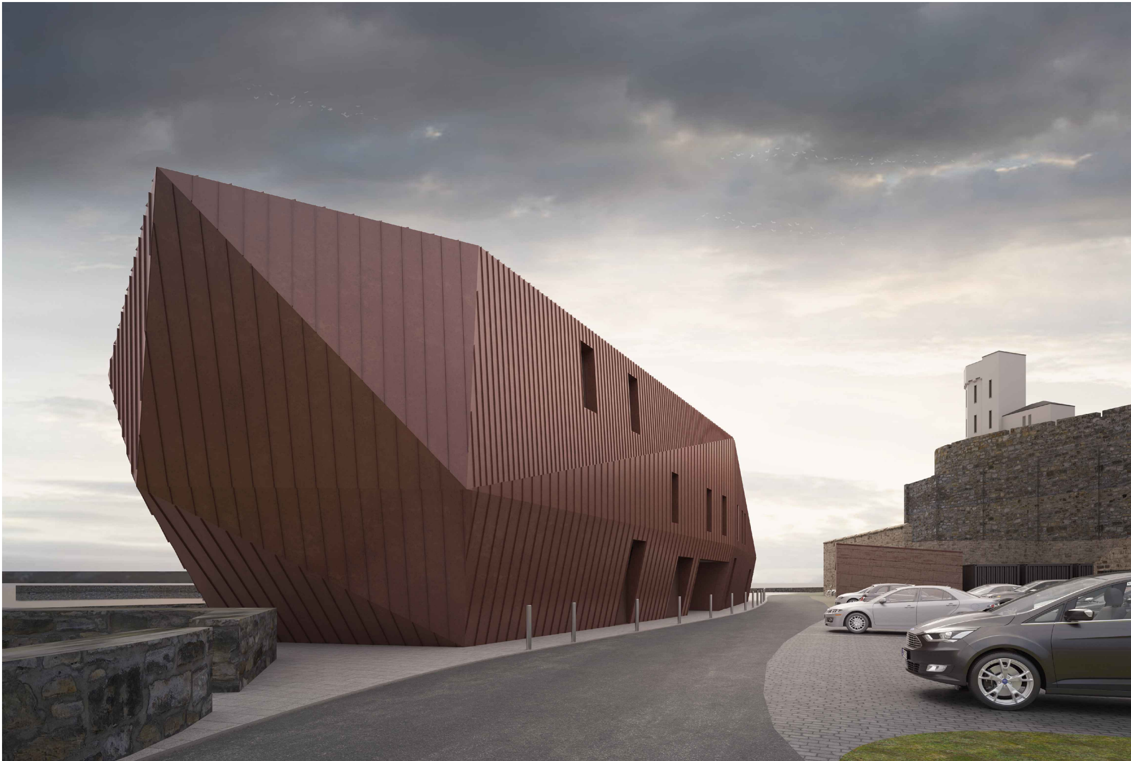
KEY VIEW 5

This drawing is to be read in conjunction with all other relevant technical information, statutory approvals, specifications and 3rd party information. Do not scale from this drawing. Use only dimensions provided. All dimensions and levels to be checked on site and all discrepancies must be reported to the drawings author immediately. Responsibility cannot be accepted for alteration and/or deviation from this design without the prior acknowledgement of the drawings author. Any commercial decisions relating to this information must make due allowance for dimensional and area variation resulting from the design development and construction processes as well as the requirements of statutory authorities. This drawing is to be used only for the purposes indicated. This drawing is copyright and the property of Northmill Associates Ltd (NMA) and must not be reproduced without prior written agreement. Any Intellectual Property Rights (IPR) relating to the design(s) described in this drawing belong to the originating designer and, where it is not NMA's design, no credit for the design or IPR is sought by this drawings author.