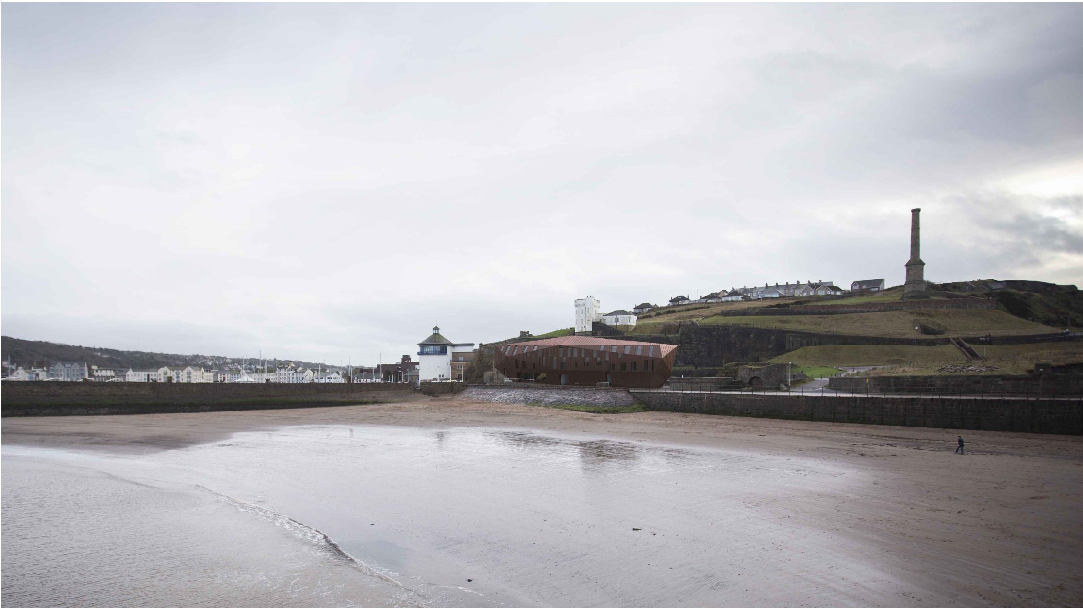
KEY VIEW 4

This drawing is to be read in conjunction with all other relevant technical information, statutory approvals, specifications and 3rd party information. Do not scale from this drawing. Use only dimensions provided. All dimensions and levels to be checked on site and all discrepancies must be reported to the drawings author immediately. Responsibility cannot be accepted for alteration and/or deviation from this design without the prior acknowledgement of the drawings author. Any commercial decisions relating to this information must make due allowance for dimensional and area variation resulting from the design development and construction processes as well as the requirements of statutory authorities. This drawing is to be used only for the purposes indicated. This drawing is copyright and the property of Northmill Associates Ltd (NMA) and must not be reproduced without prior written agreement. Any Intellectual Property Rights (IPR) relating to the design(s) described in this drawing belong to the originating designer and, where it is not NMA's design, no credit for the design or IPR is sought by this drawings author.