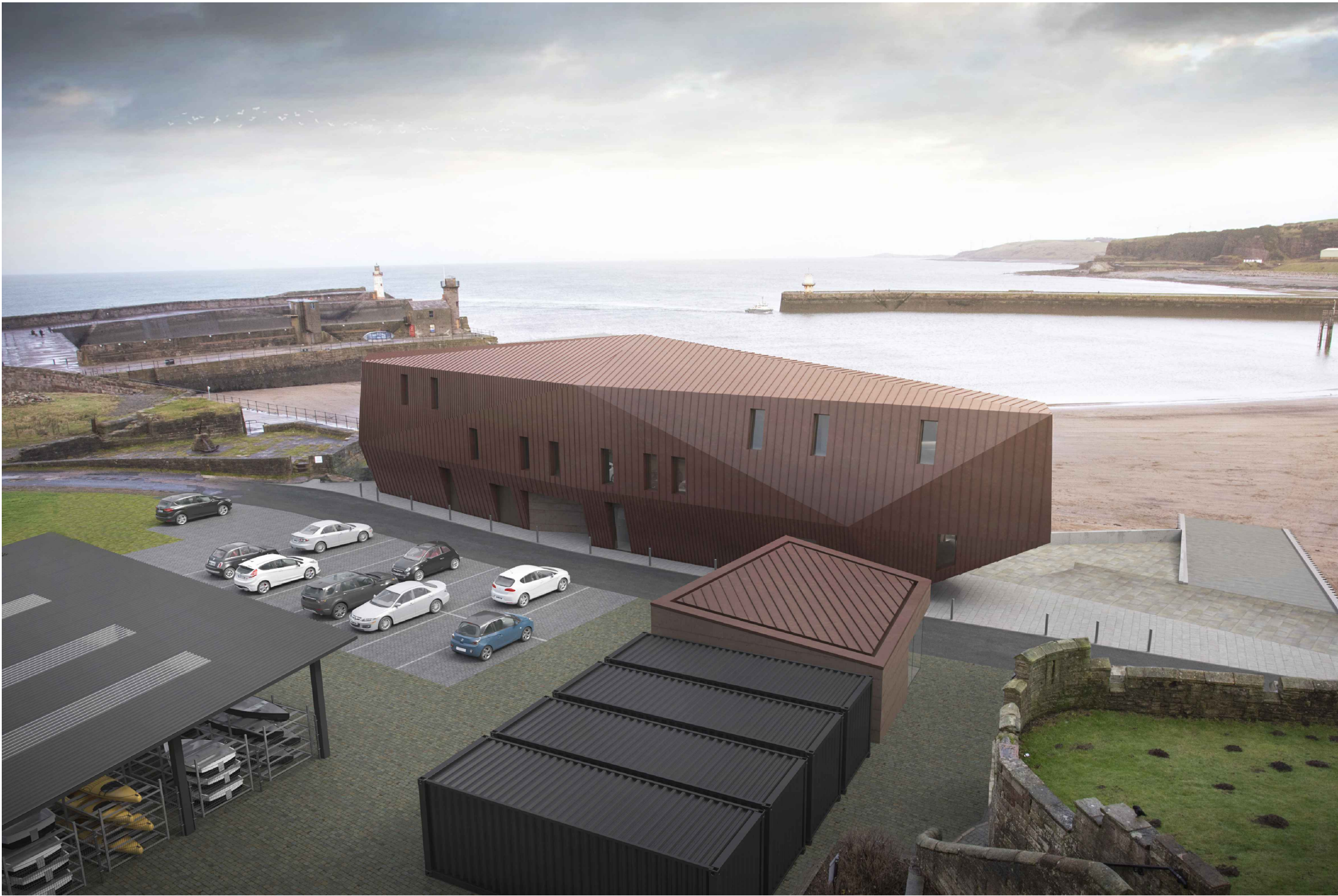
KEY VIEW 3

This drawing is to be read in conjunction with all other relevant technical information, statutory approvals, specifications and 3rd party information. Do not scale from this drawing. Use only dimensions provided. All dimensions and levels to be checked on site and all discrepancies must be reported to the drawings author immediately. Responsibility cannot be accepted for alteration and/or deviation from this design without the prior acknowledgement of the drawings author. Any commercial decisions relating to this information must make due allowance for dimensional and area variation resulting from the design development and construction processes as well as the requirements of statutory authorities. This drawing is to be used only for the purposes indicated. This drawing is copyright and the property of Northmill Associates Ltd (NMA) and must not be reproduced without prior written agreement. Any Intellectual Property Rights (IPR) relating to the design(s) described in this drawing belong to the originating designer and, where it is not NMA's design, no credit for the design or IPR is sought by this drawings author.