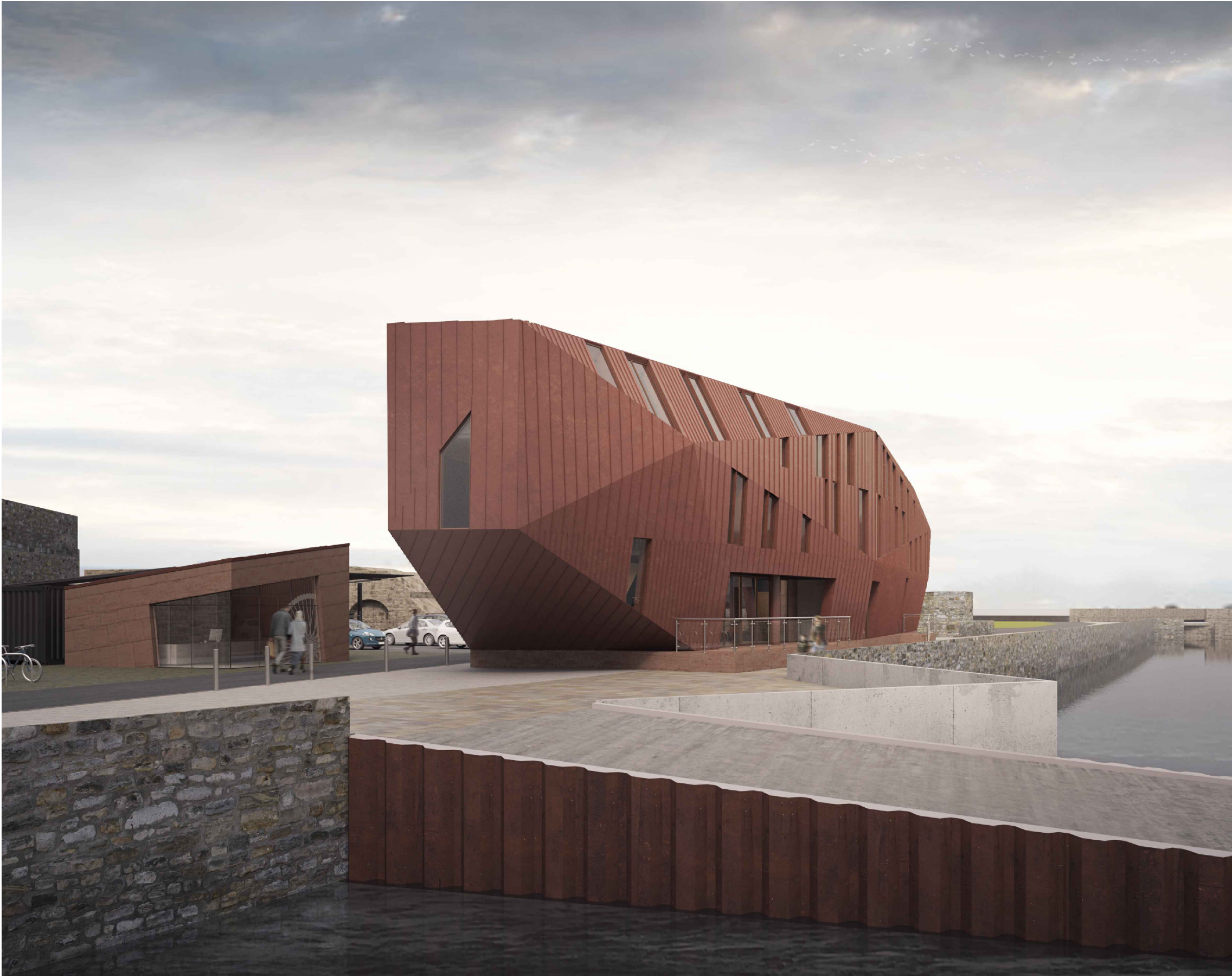
KEY VIEW 2

This drawing is to be read in conjunction with all other relevant technical information, statutory approvals, specifications and 3rd party information. Do not scale from this drawing. Use only dimensions provided. All dimensions and levels to be checked on site and all discrepancies must be reported to the drawings author immediately. Responsibility cannot be accepted for alteration and/or deviation from this design without the prior acknowledgement of the drawings author. Any commercial decisions relating to this information must make due allowance for dimensional and area variation resulting from the design development and construction processes as well as the requirements of statutory authorities. This drawing is to be used only for the purposes indicated. This drawing is copyright and the property of Northmill Associates Ltd (NMA) and must not be reproduced without prior written agreement. Any Intellectual Property Rights (IPR) relating to the design(s) described in this drawing belong to the originating designer and, where it is not NMA's design, no credit for the design or IPR is sought by this drawings author.