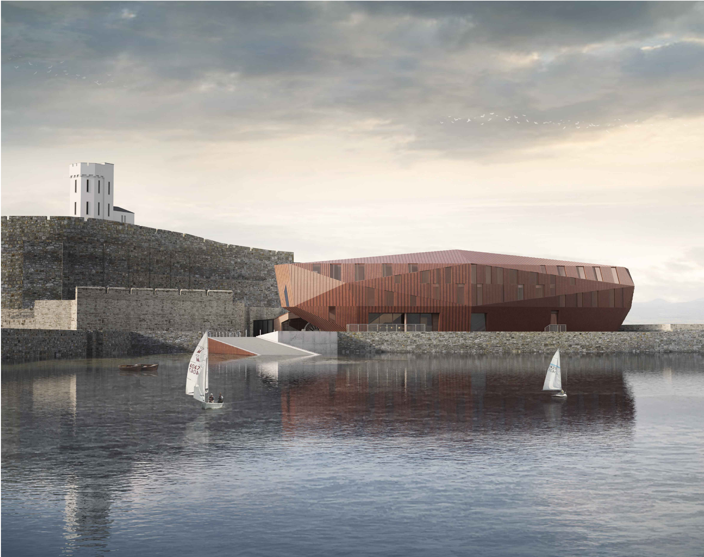
KEY VIEW 1

This drawing is to be read in conjunction with all other relevant technical information, statutory approvals, specifications and 3rd party information. Do not scale from this drawing. Use only dimensions provided. All dimensions and levels to be checked on site and all discrepancies must be reported to the drawings author immediately. Responsibility cannot be accepted for alteration and/or deviation from this design without the prior acknowledgement of the drawings author. Any commercial decisions relating to this information must make due allowance for dimensional and area variation resulting from the design development and construction processes as well as the requirements of statutory authorities. This drawing is to be used only for the purposes indicated. This drawing is copyright and the property of Northmill Associates Ltd (NMA) and must not be reproduced without prior written agreement. Any Intellectual Property Rights (IPR) relating to the design(s) described in this drawing belong to the originating designer and, where it is not NMA's design, no credit for the design or IPR is sought by this drawings author.