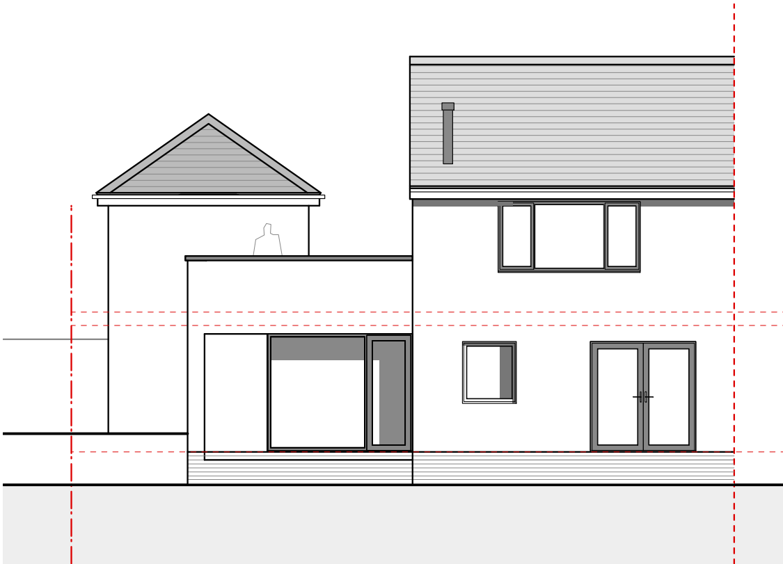
Existing Rear Elevation Scale 1:100 @ A3