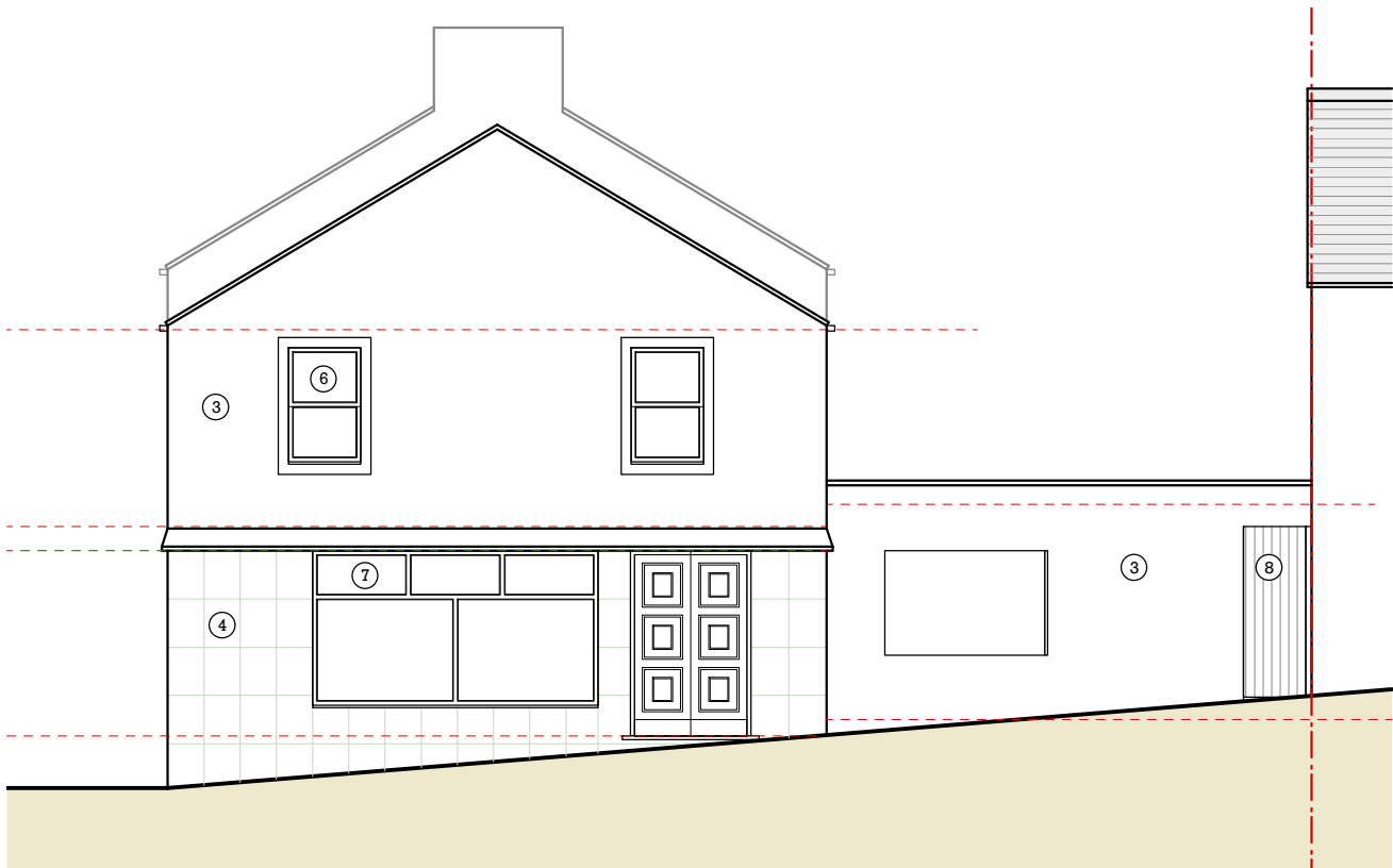
Existing Front Elevation (Church Lane) - (North-North-West) Scale 1:100 @ A3

Drawings subject to relevant statutory approvals.