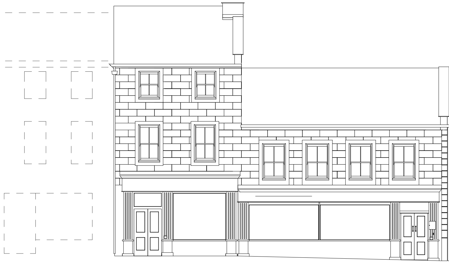
1 | North East 1 : 100