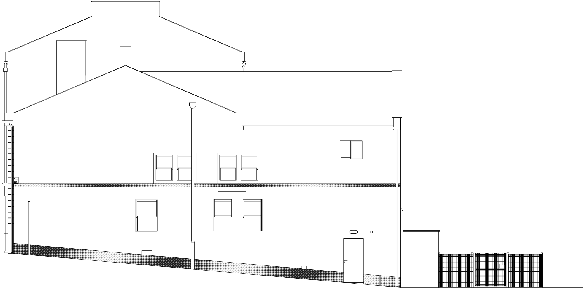
2 | North West 1 : 100