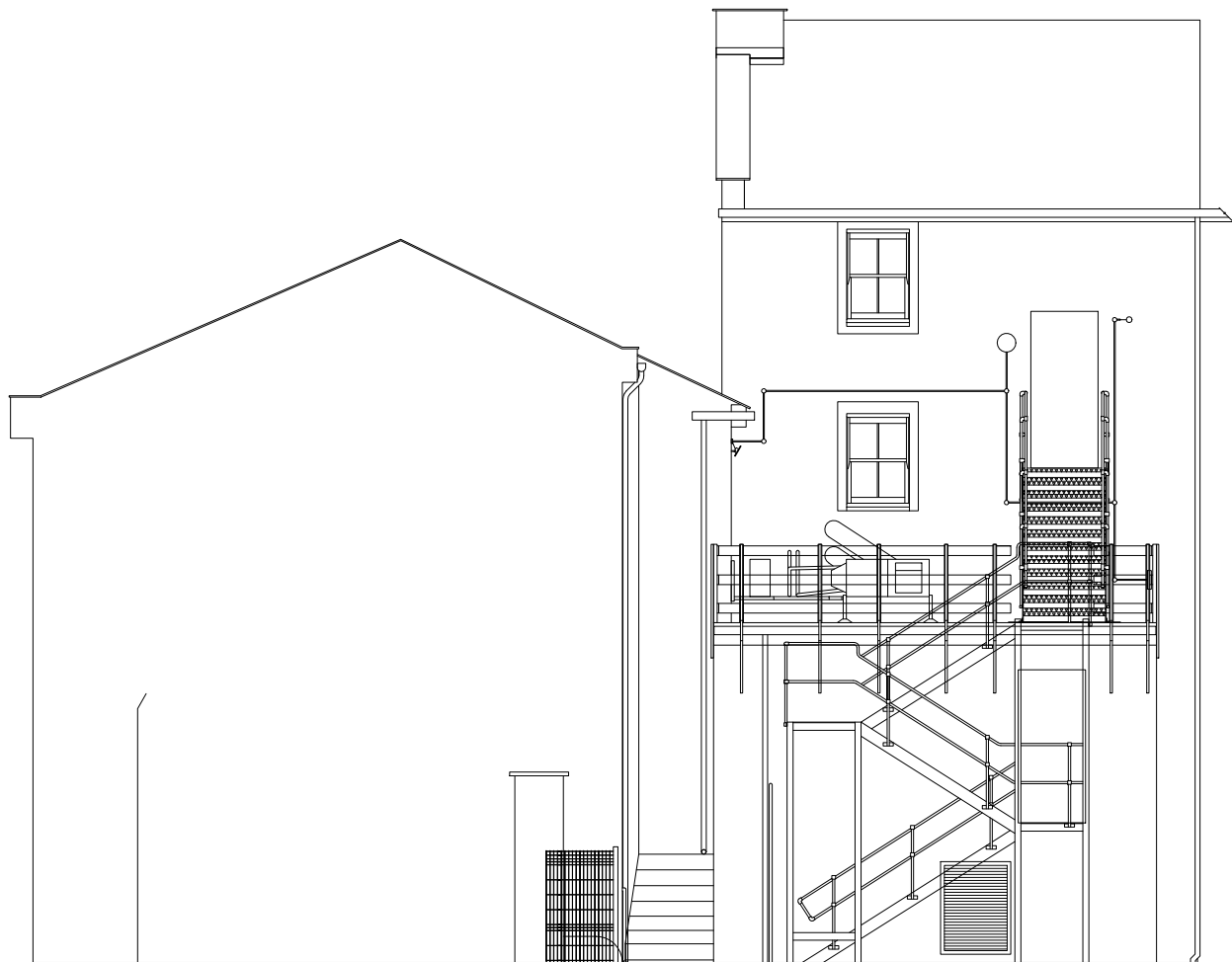
3 | South West 1 : 100