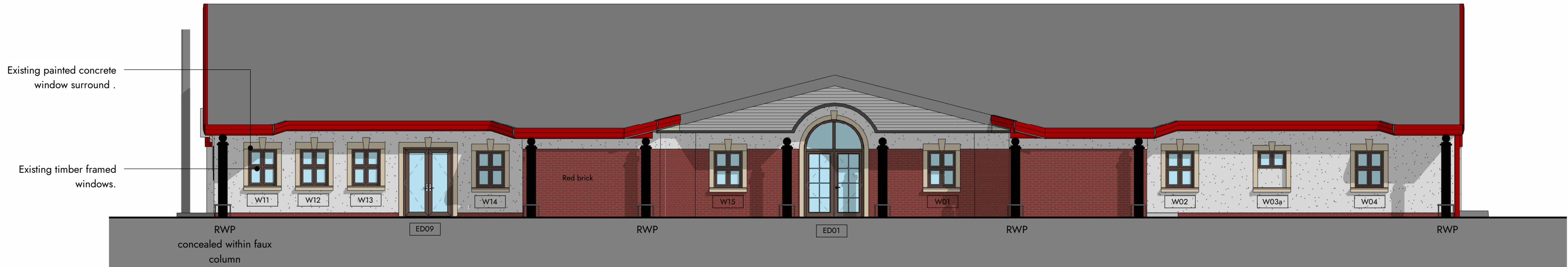
Existing South West 1 : 100