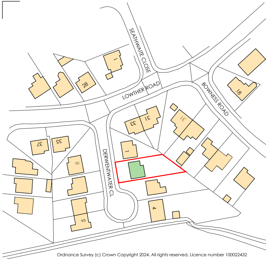
LOCATION PLAN @ 1:1250 △