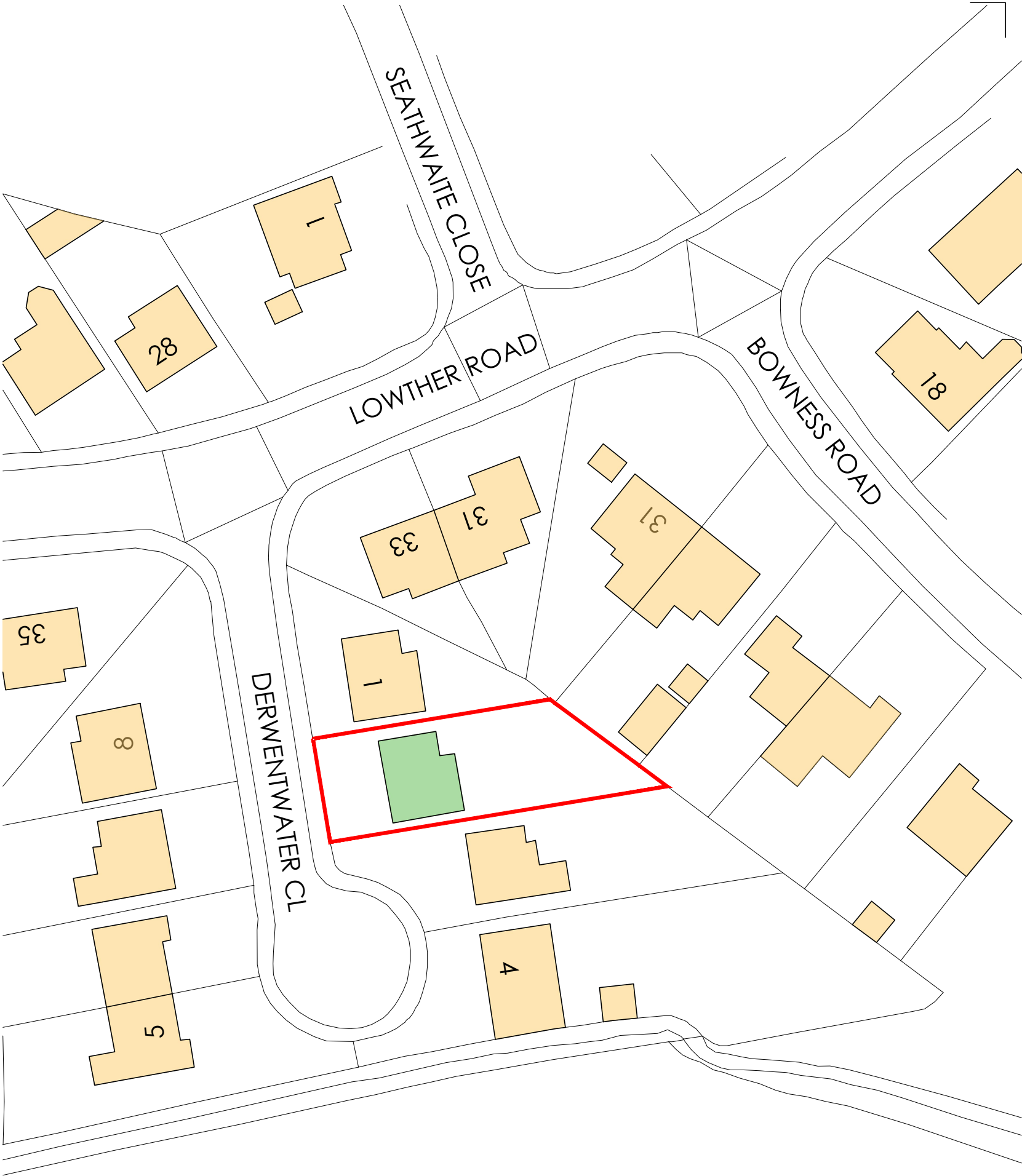
BLOCK PLAN @ 1:500 ▷