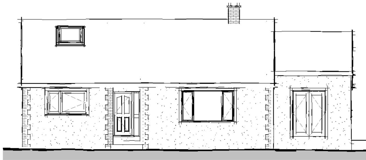
Side Elevation 02 1 : 100