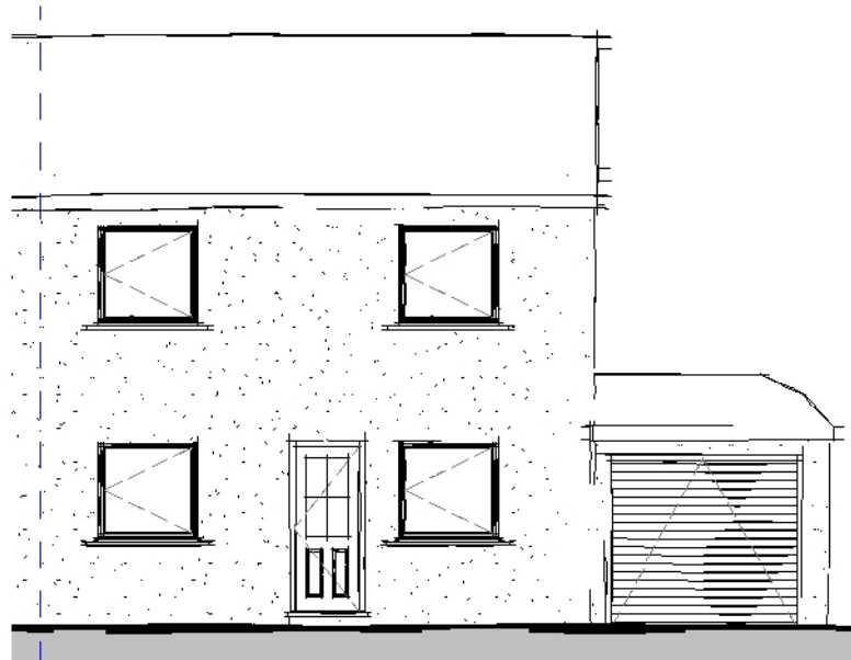
Front Elevation 1 : 100