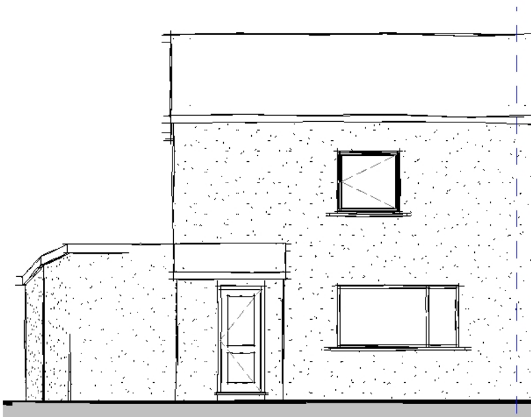
Rear Elevation 1 : 100