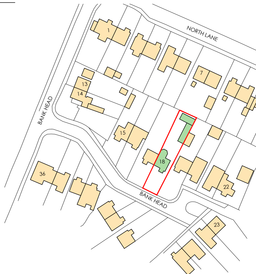
LOCATION PLAN @ 1:1250 △