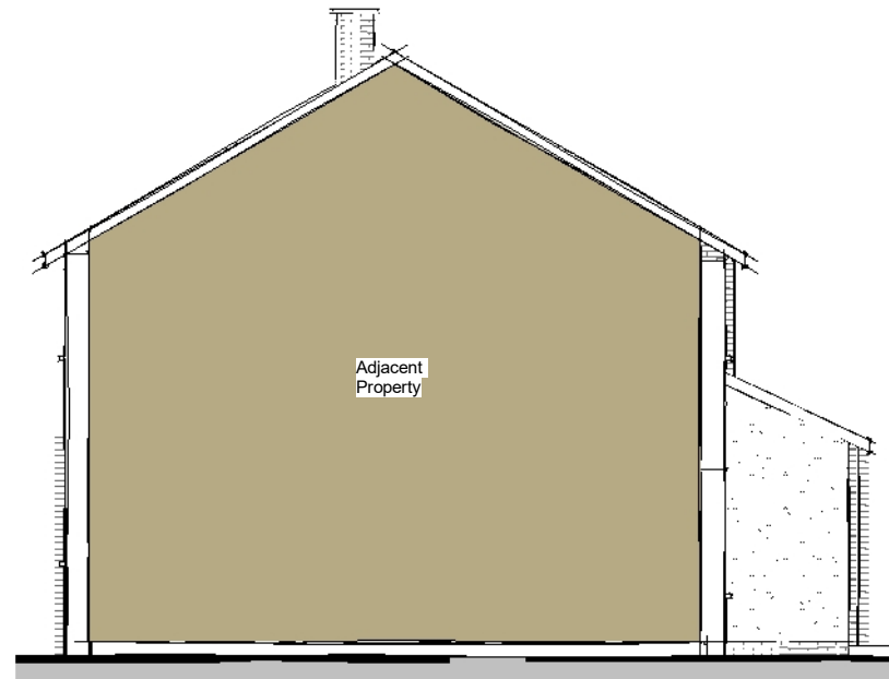
Side Elevation 02