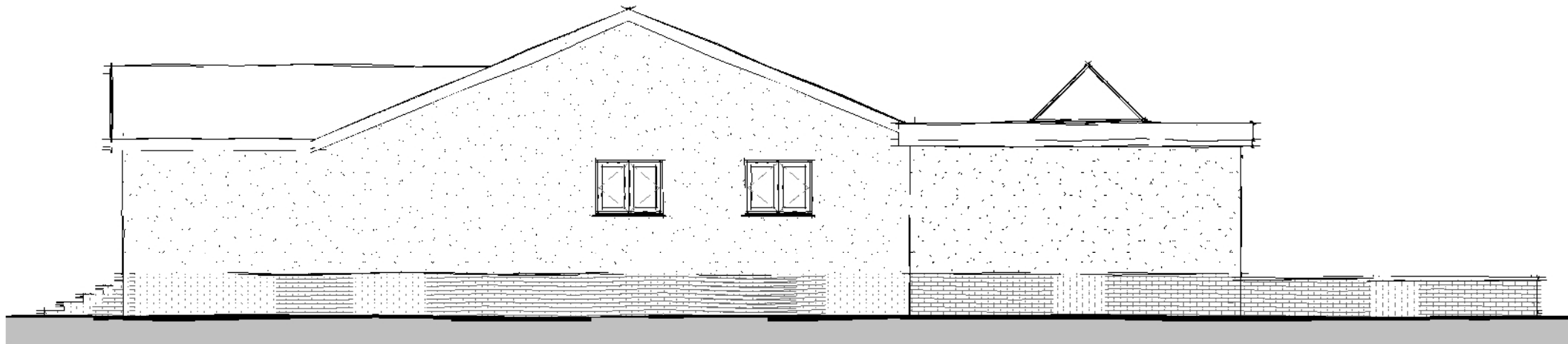
Side Elevation 01 1 : 100