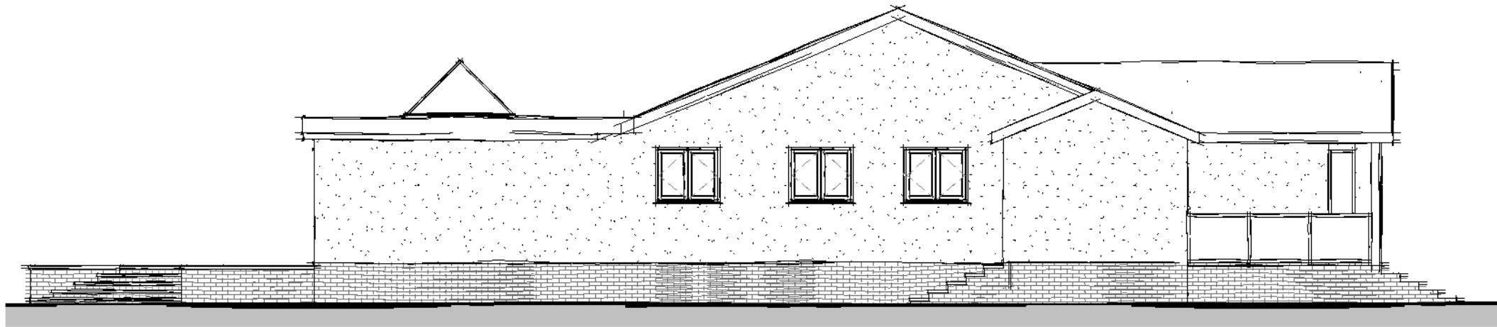
Side Elevation 02 1 : 100