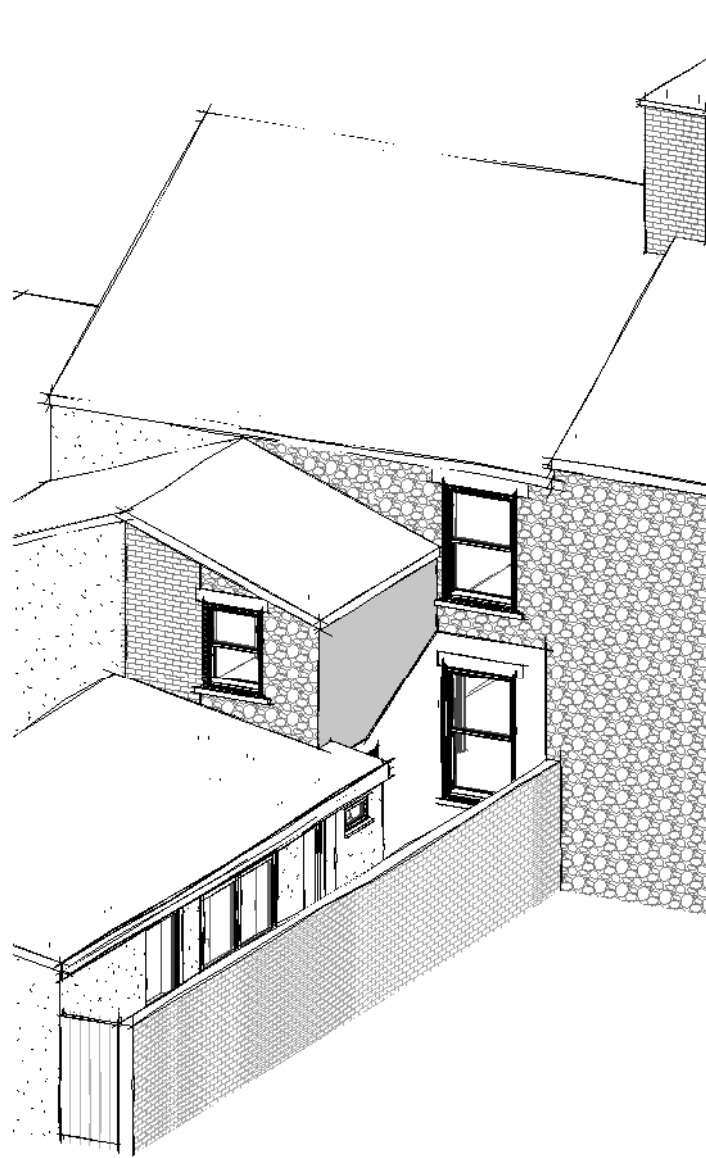
Rear View 02