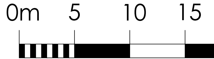
△ PROPOSED SITE PLAN @ 1:200

Drawing Reference: 24-06-P-01 Revision: -