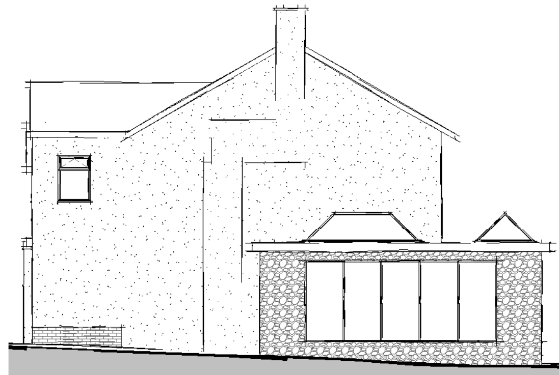
Side Elevation 02