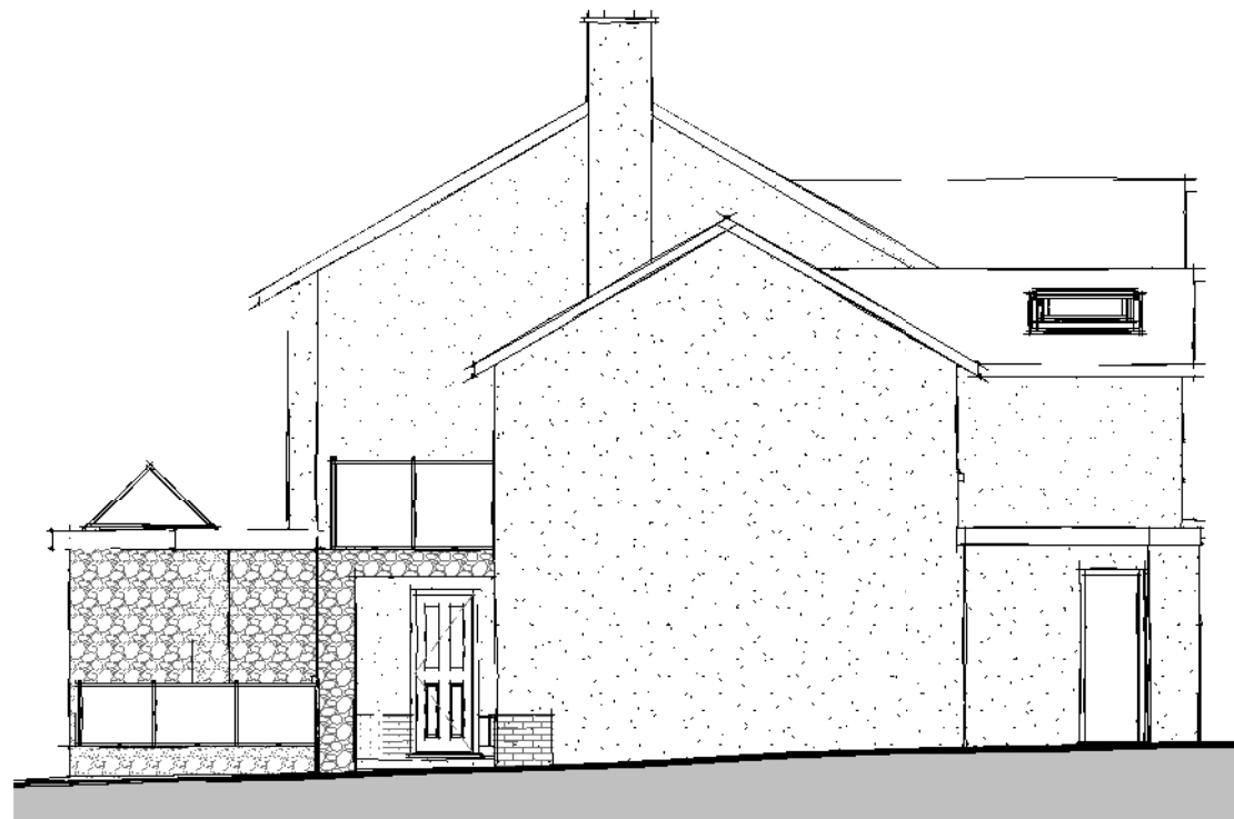
Side Elevation 01