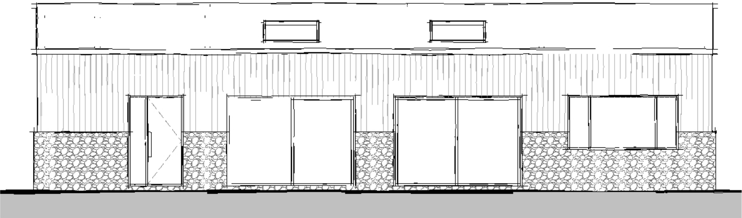
Rear Elevation 1 : 100