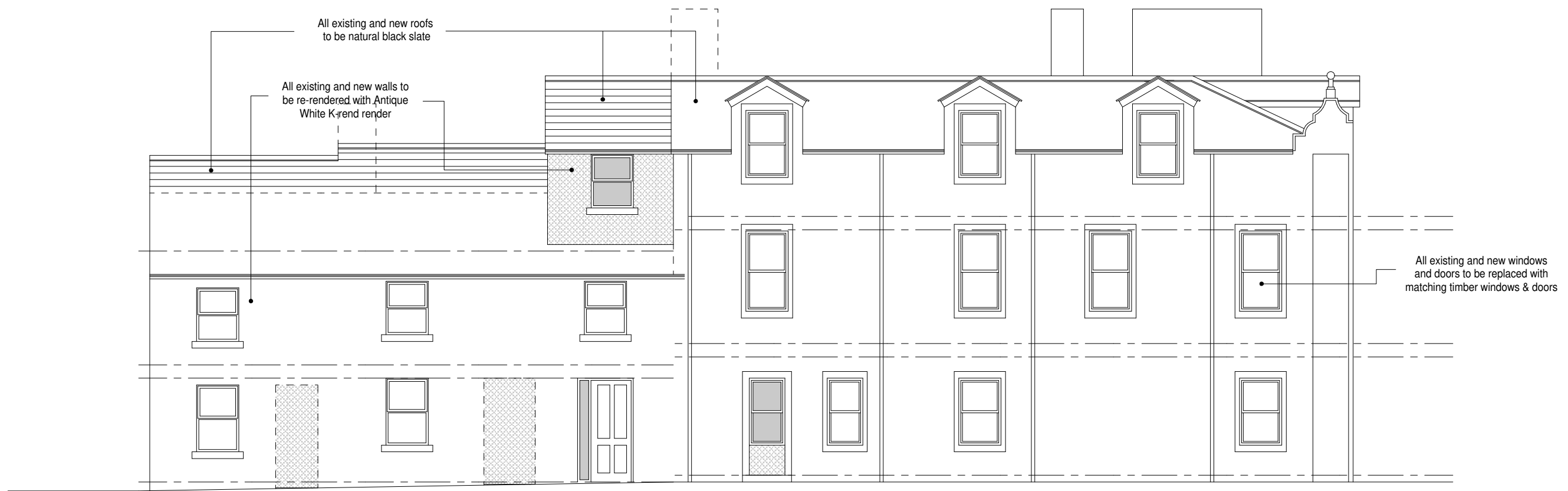
Proposed West Elevation (scale 1:100@A3)