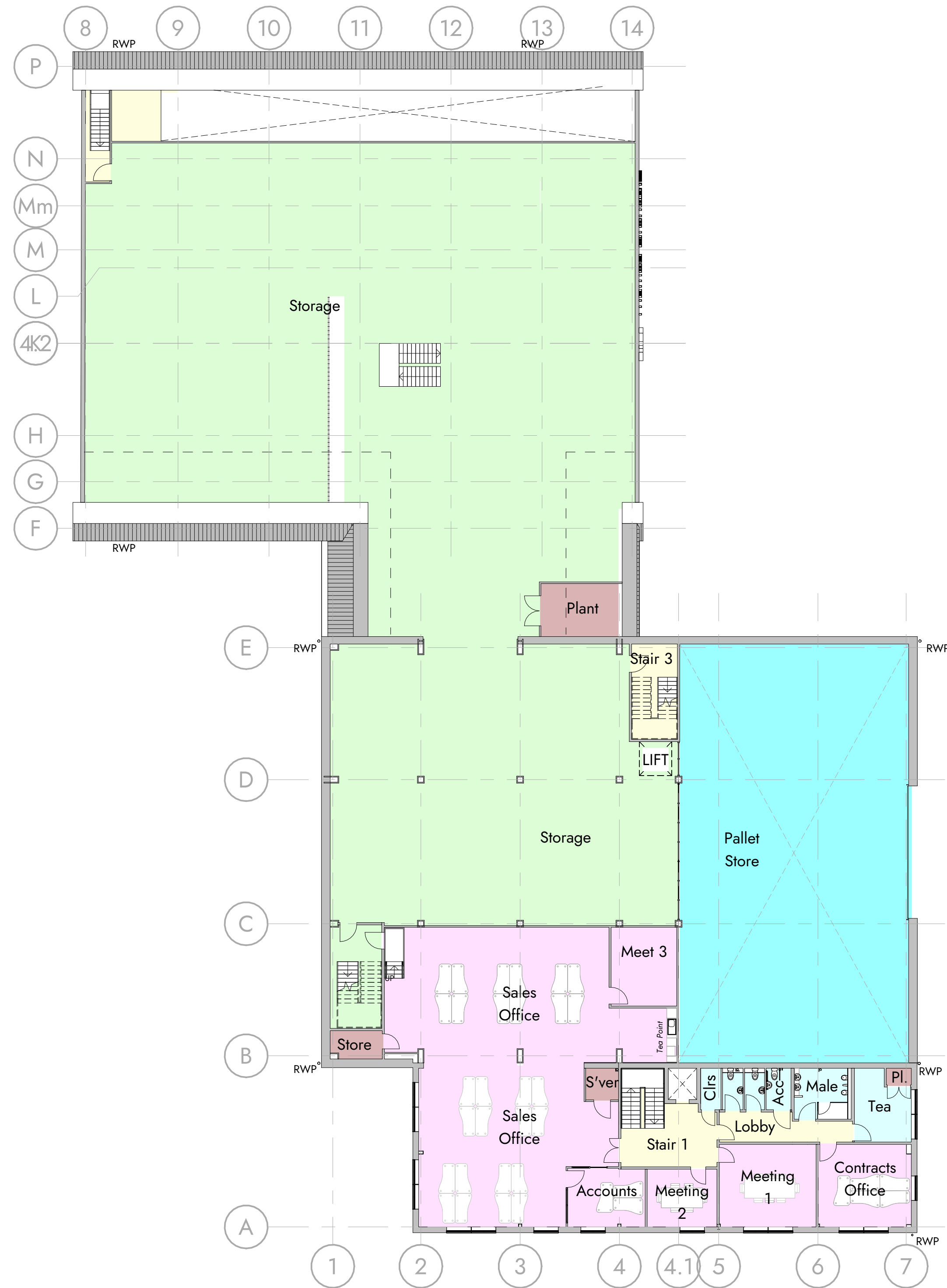
Proposed First Floor