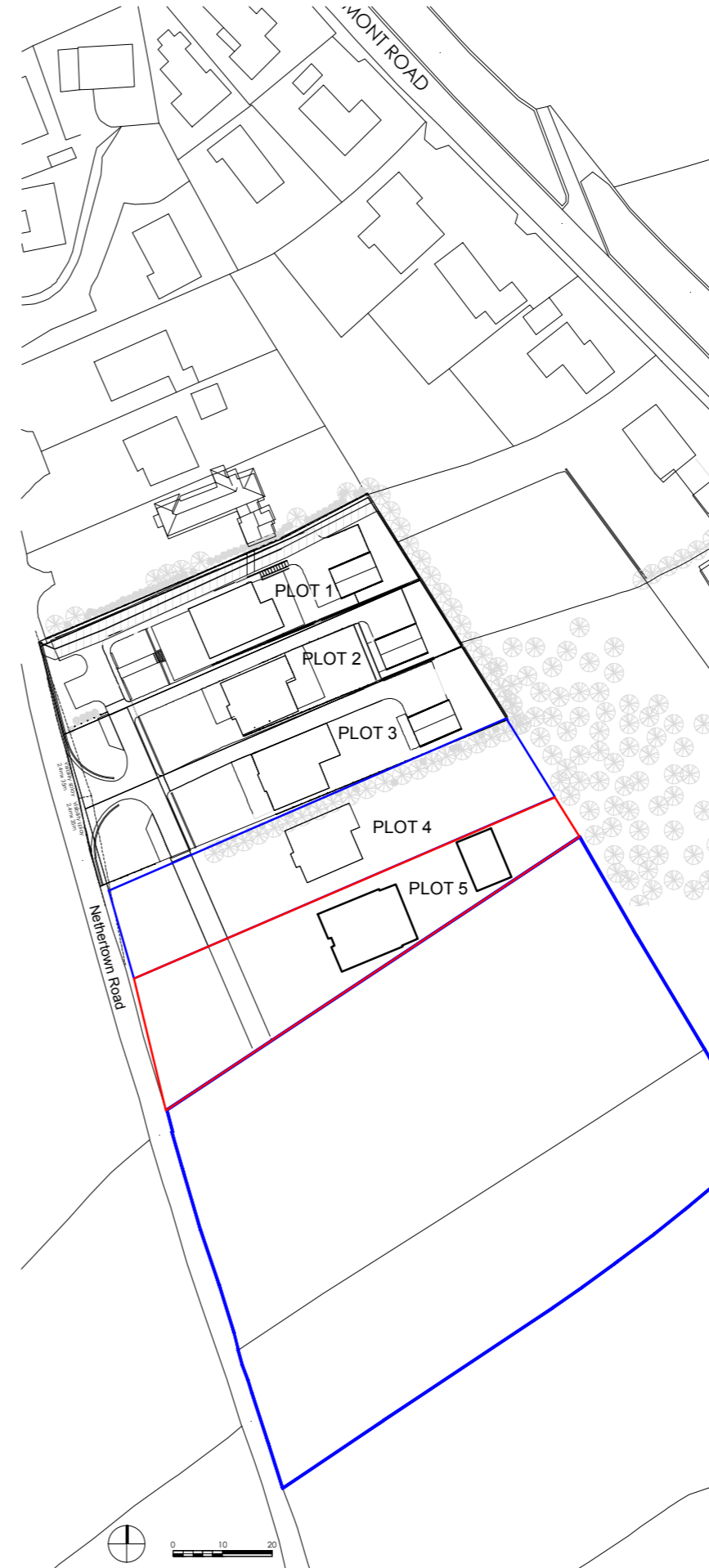
Proposed Site Location Plan