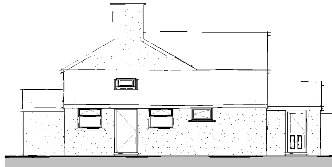
Side Elevation 01