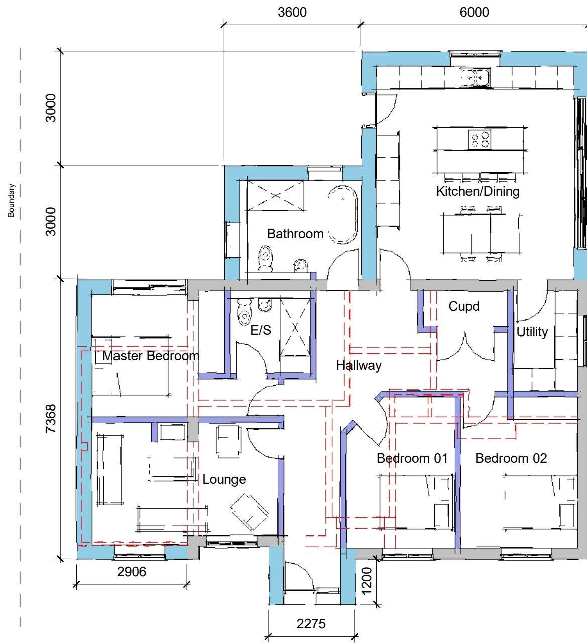
Ground 1 : 100