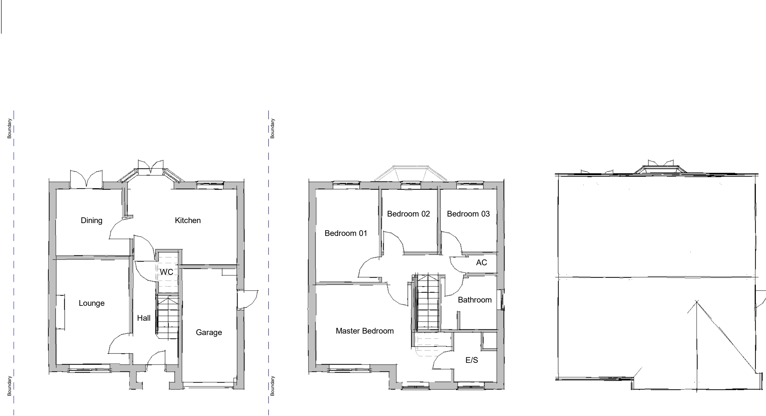
Ground 1 : 100