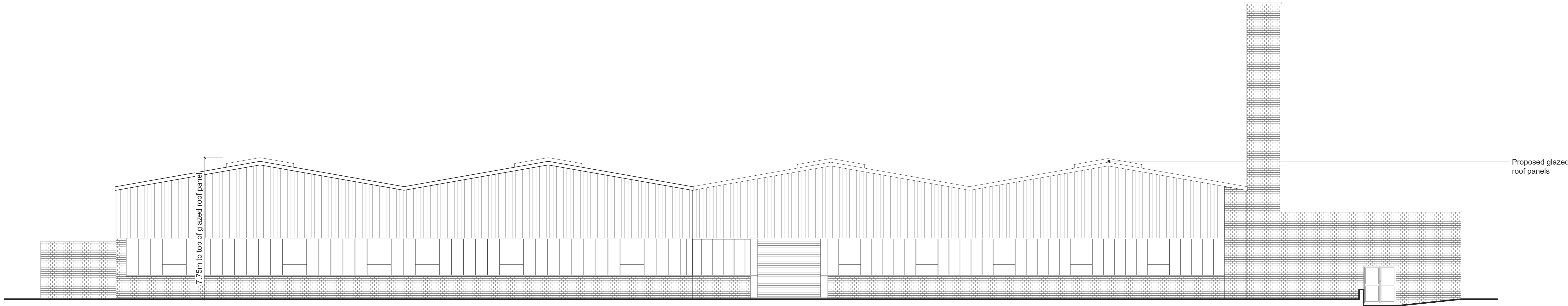
PROPOSED SOUTH EAST ELEVATION Scale 1:100