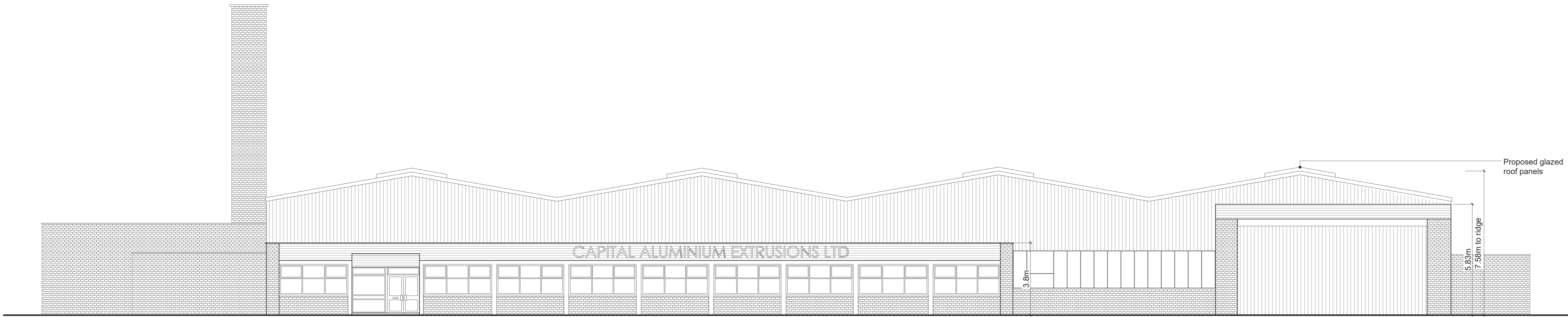
PROPOSED NORTH WEST ELEVATION Scale 1:100