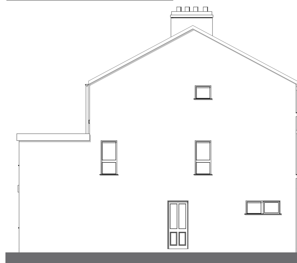
E-03 Side Elevation 1:100