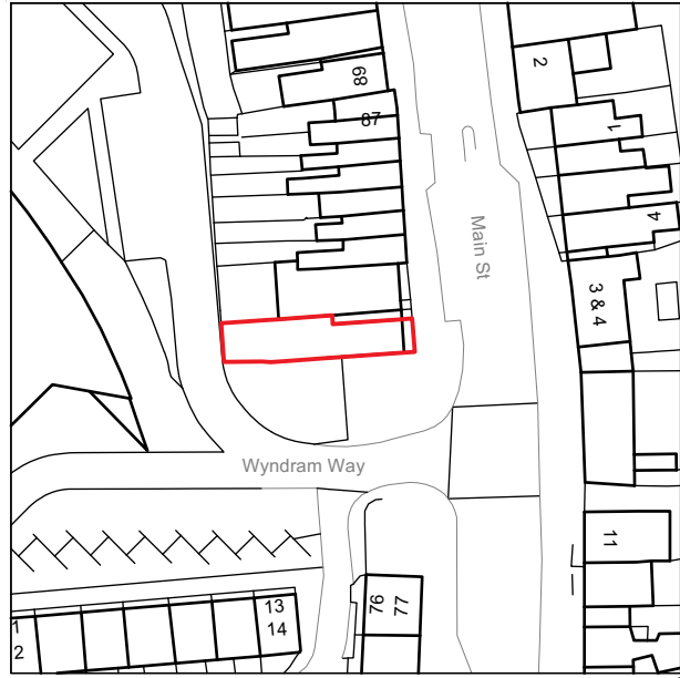
0. Location Plan 1:1250