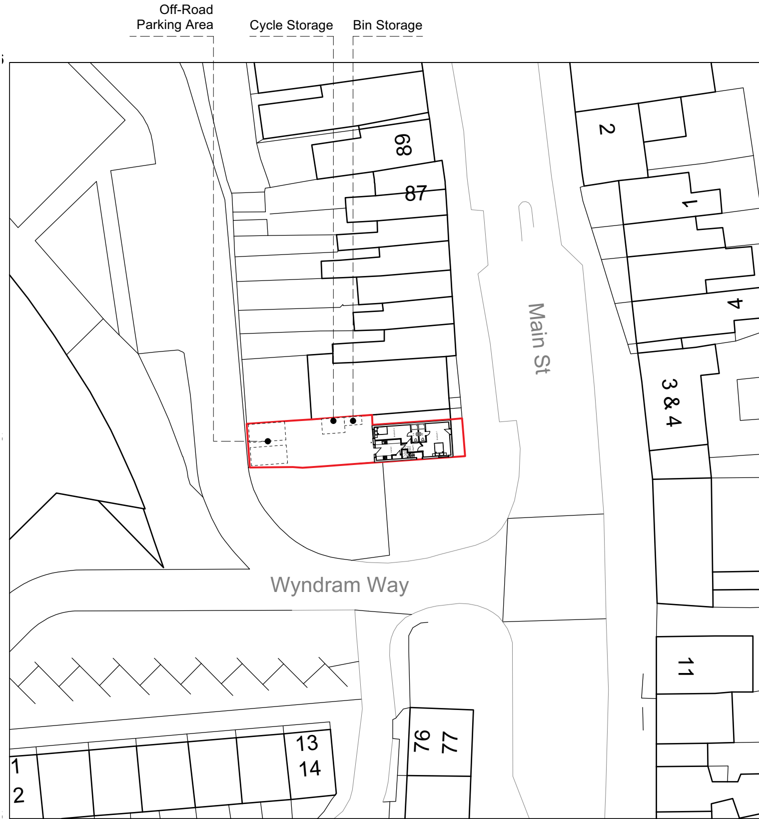
0. Block Plan 1:500