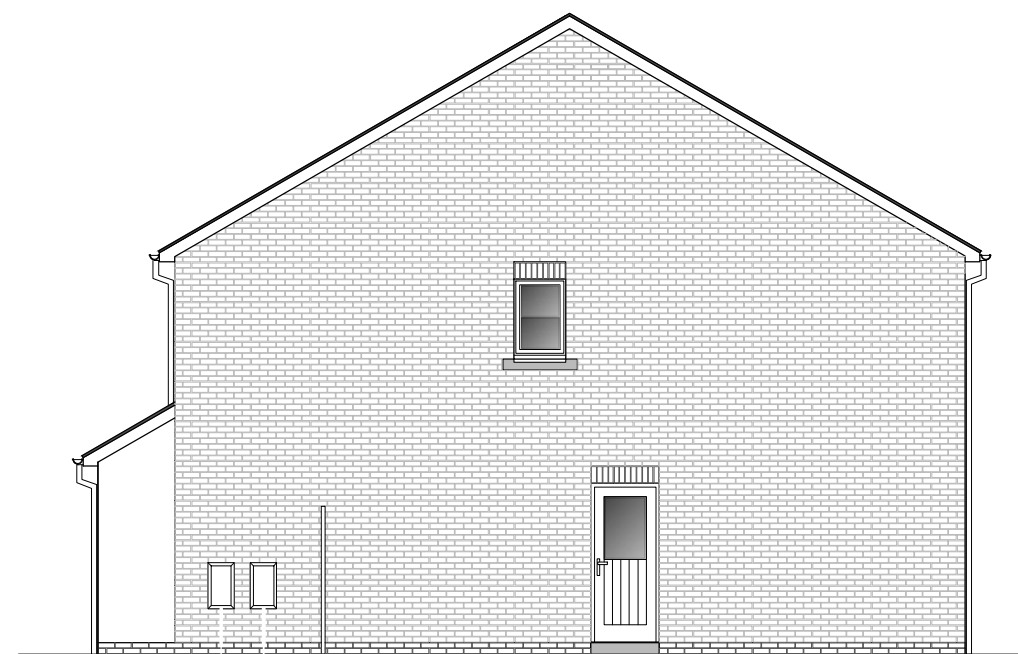
SIDE ELEVATION (RHS)