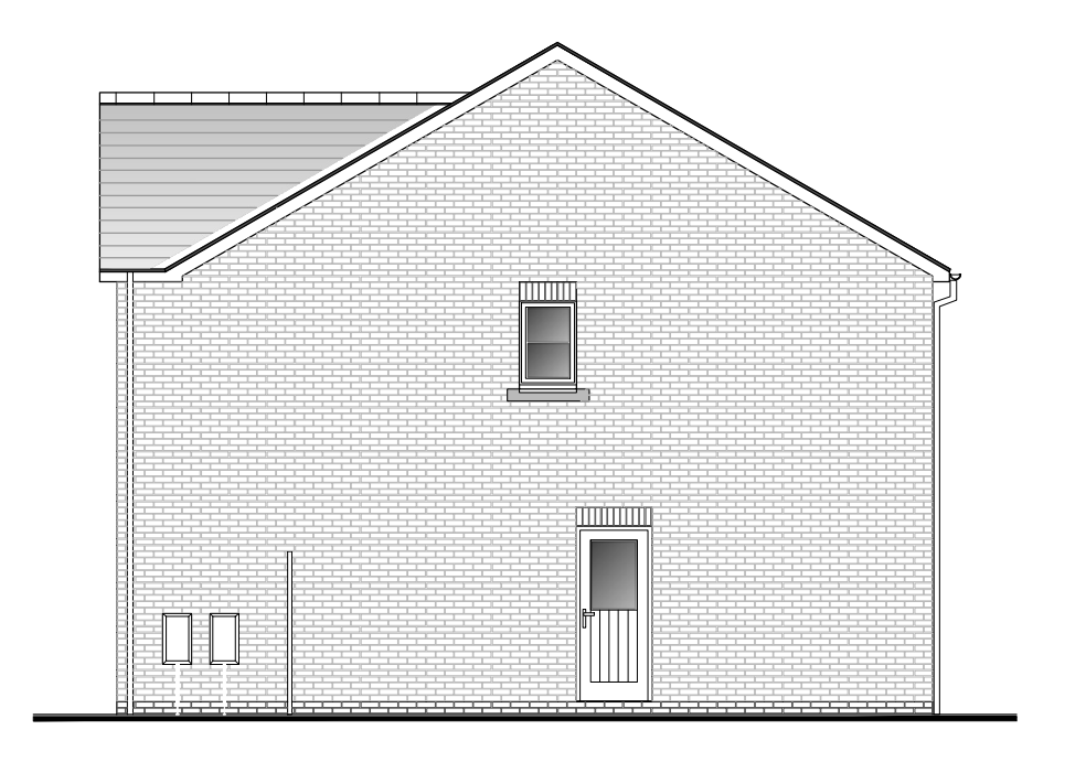
SIDE ELEVATION (RHS)

© COPYRIGHT MANNING ELLIOTT PARTNERSHIP 2024