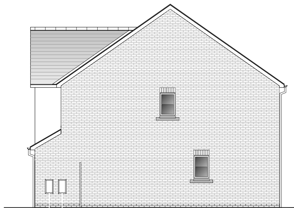
SIDE ELEVATION (RHS)