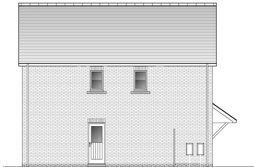
SIDE ELEVATION (LHS)