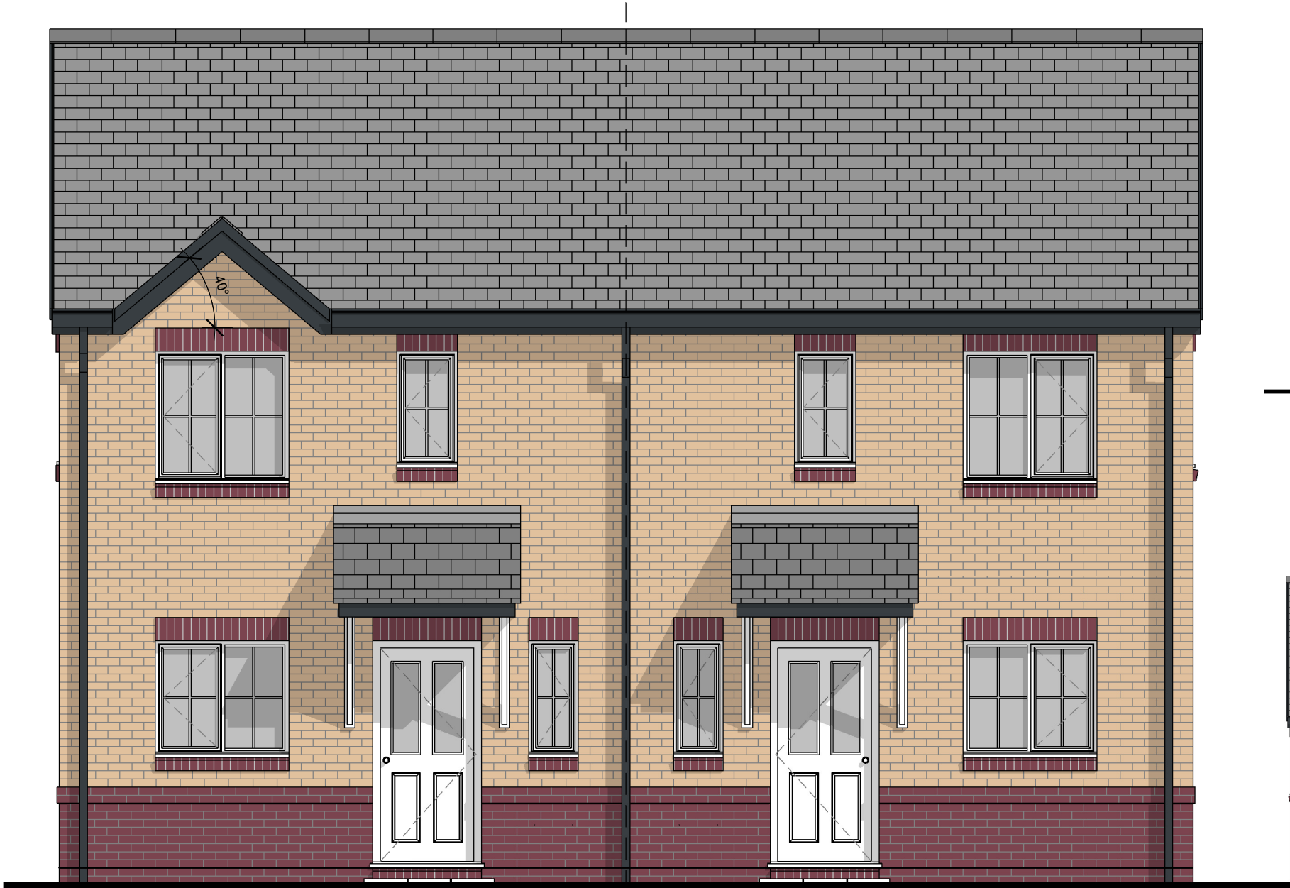
Front Elevation 1:50