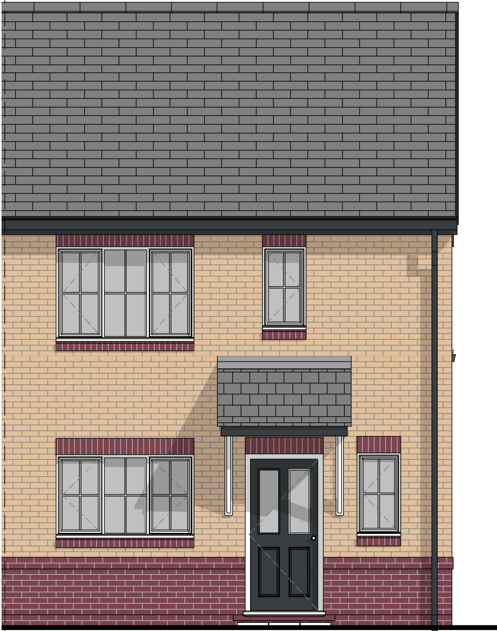
Front Elevation 1:50