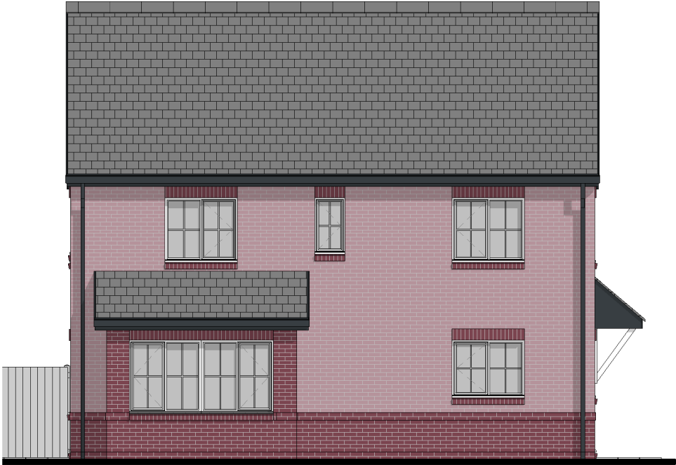
Side Elevation 1:100