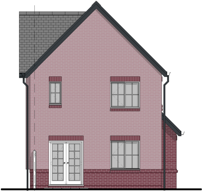
Rear Elevation 1:100