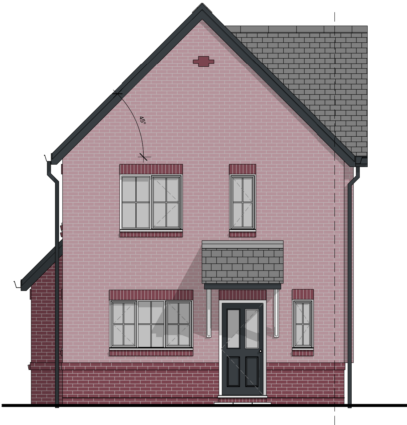
Front Elevation 1:50