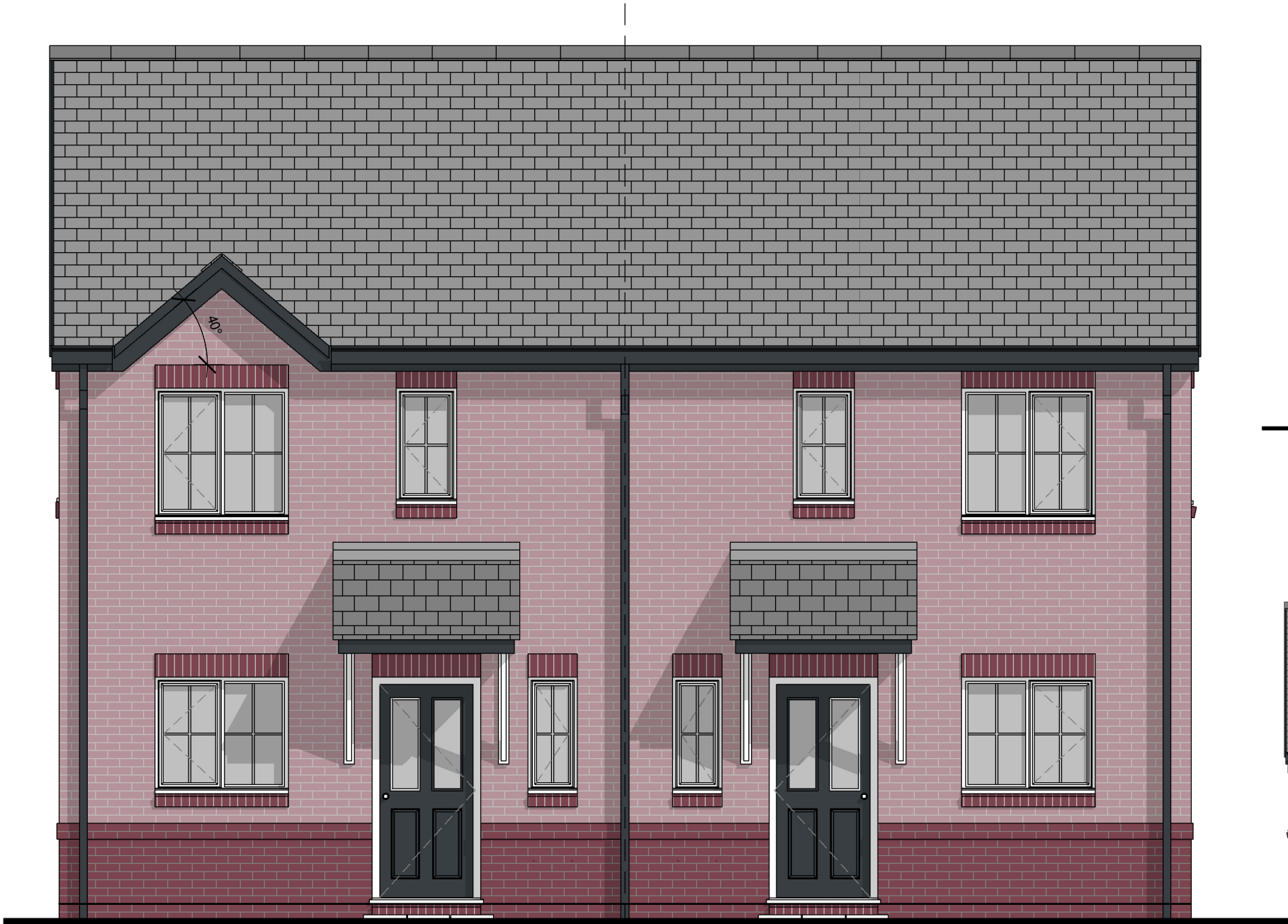
Front Elevation 1:50