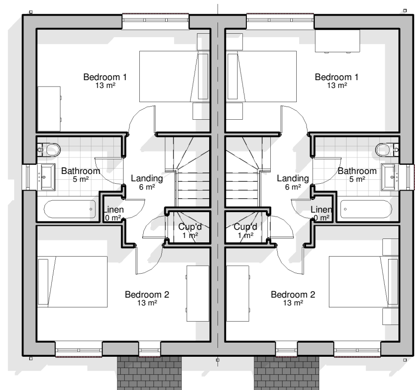
First Floor Plan 1:100