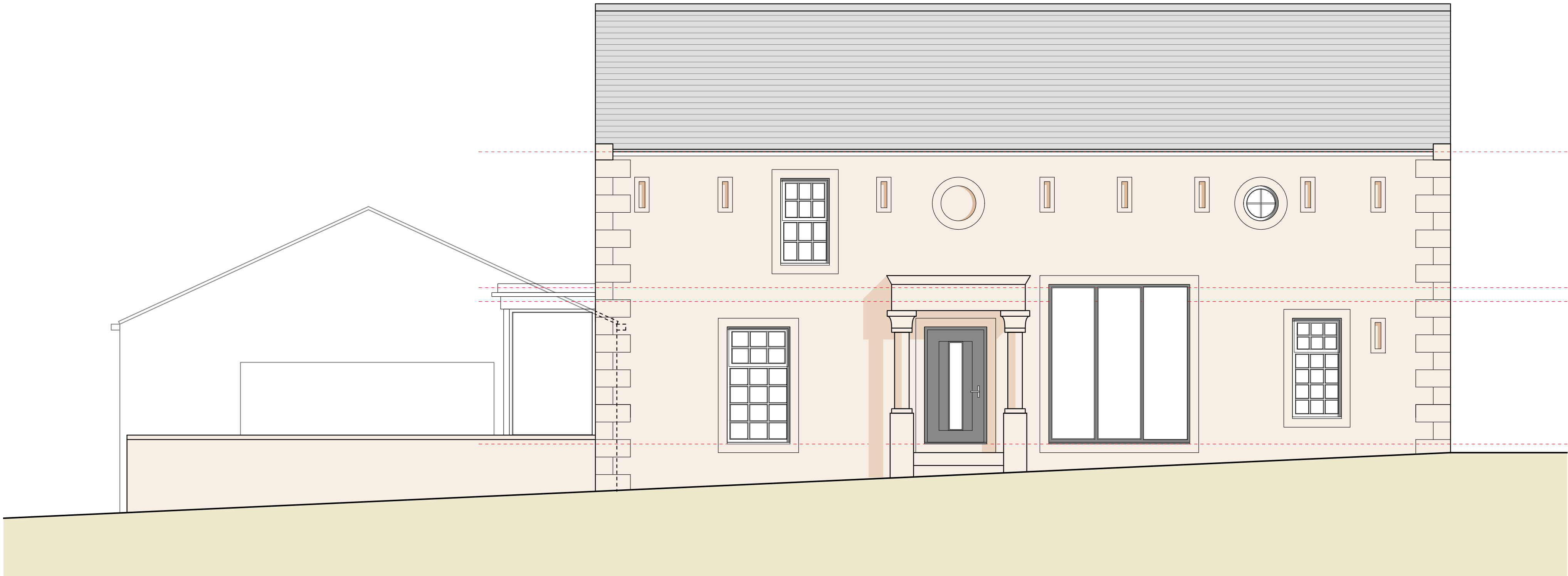
1 ELEVATION - EXISTING FRONT (WEST FACING) SCALE 1:50 @ A1

© This drawing is copyright of MC Architecture + Design Ltd and may not be reproduced in any way without their specific permission.