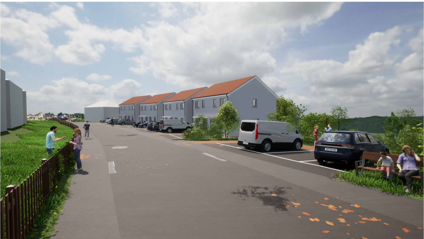
Fell View Avenue 2