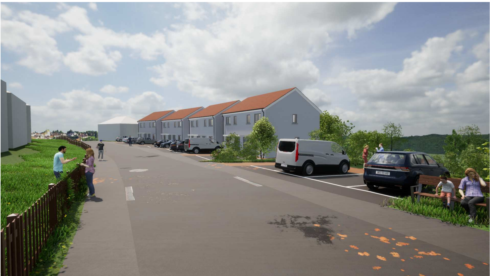
Fell View Avenue 2