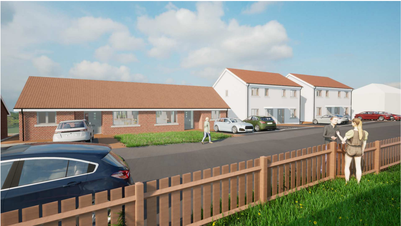
Fell View Avenue 3