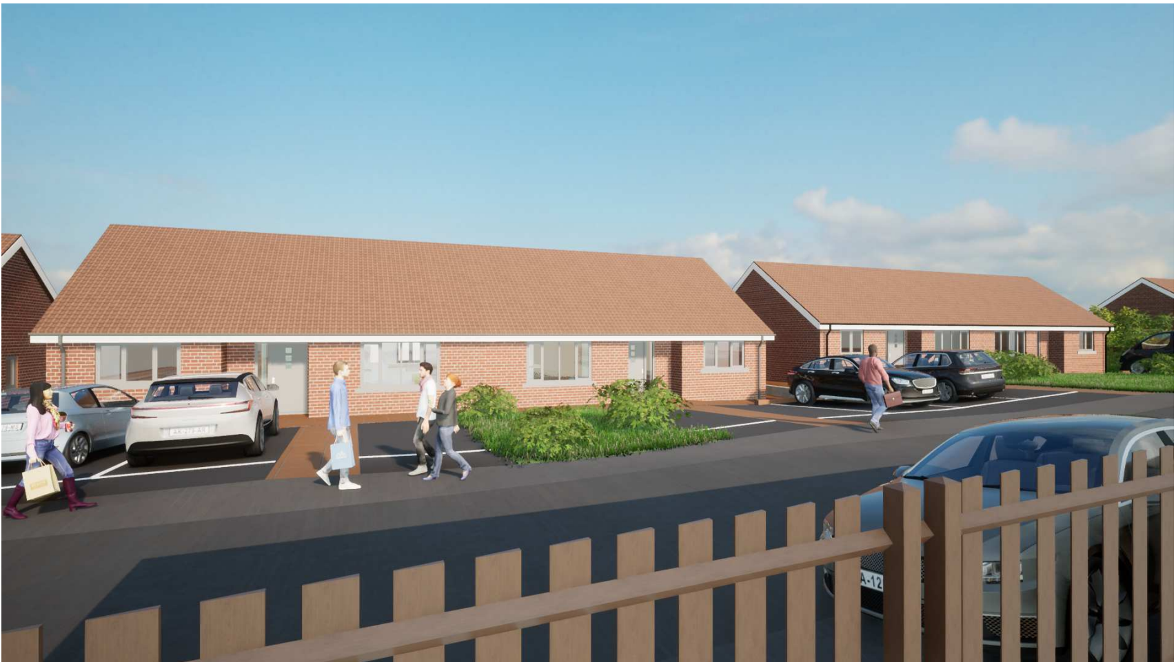
Windermere Road 1