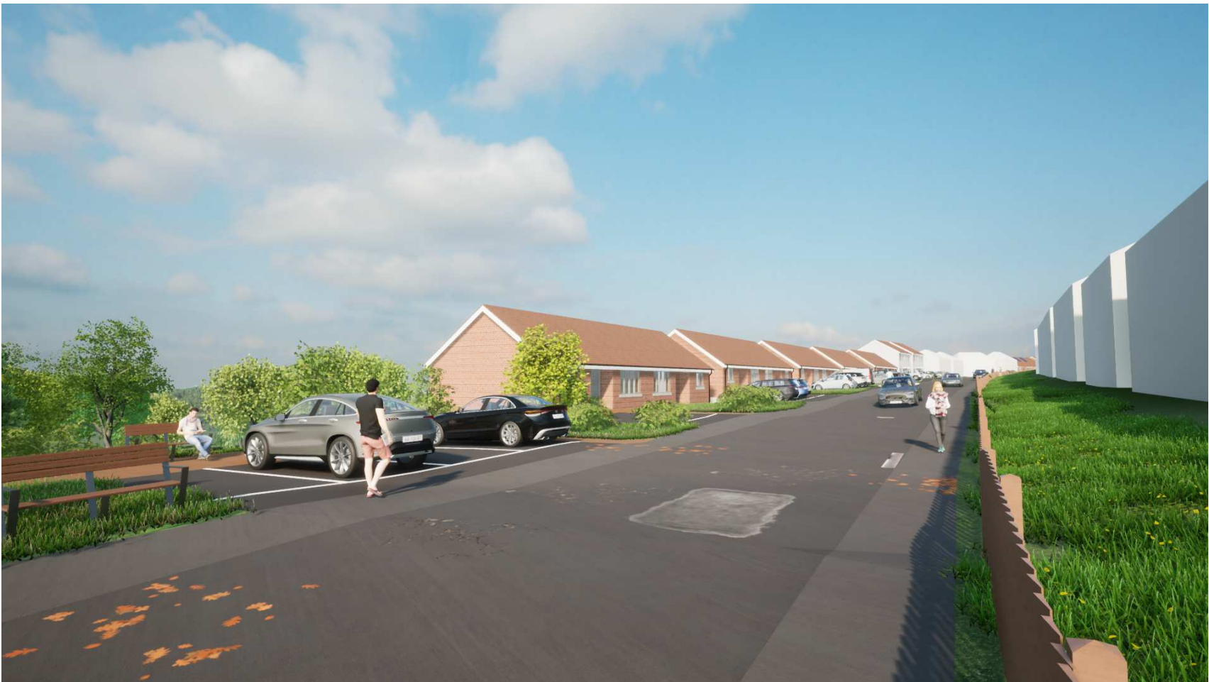
Fell View Avenue 1