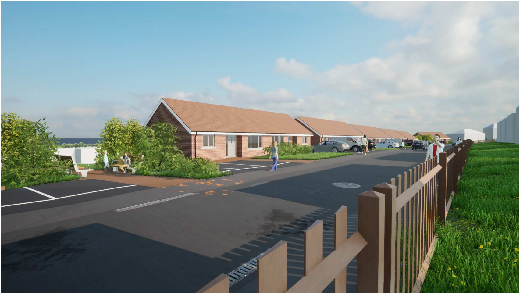
Windermere Road 3