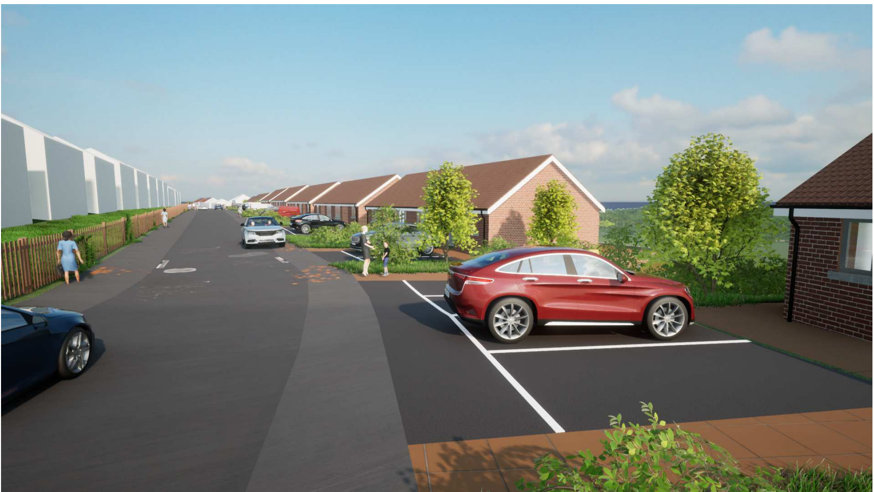
Windermere Road 2