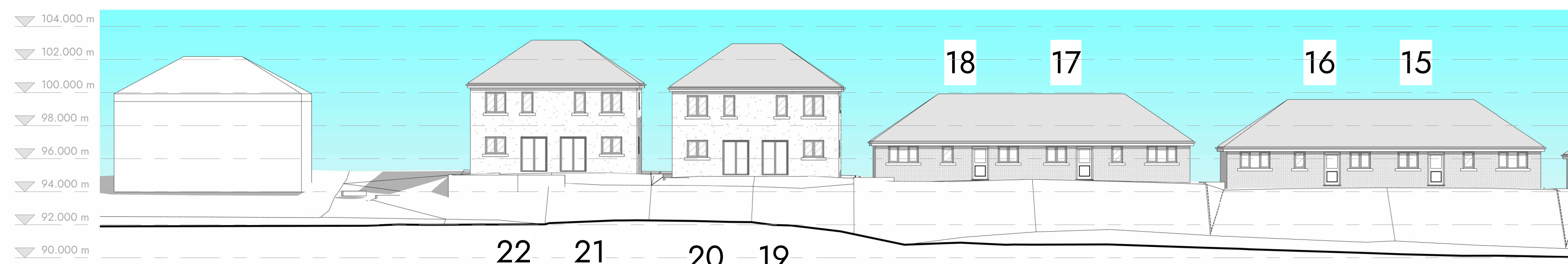
F Elevation F 1 : 200