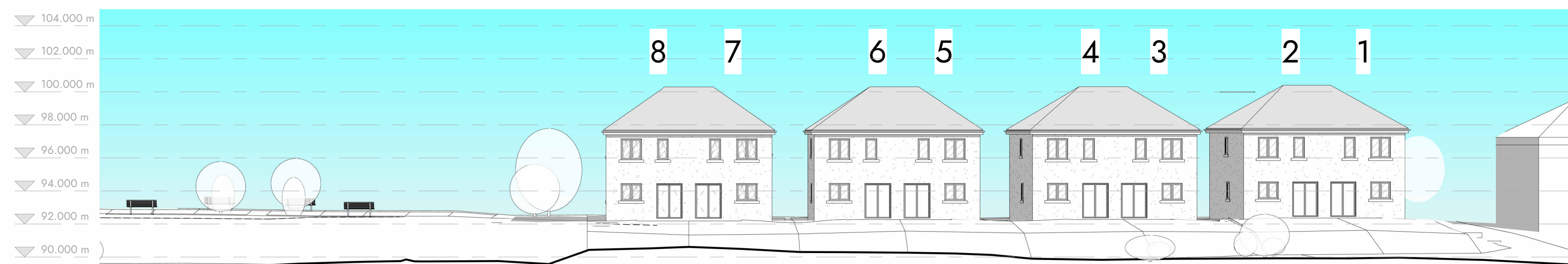
D Elevation D 1 : 200