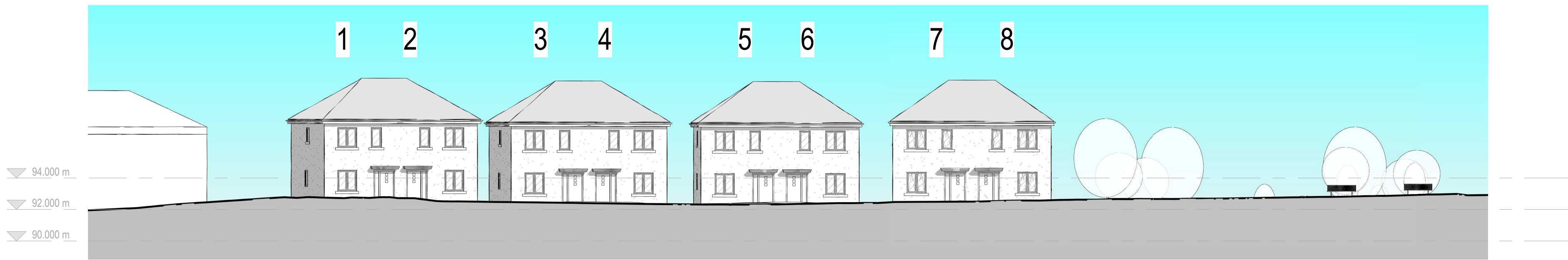
Elevation A 1 : 200