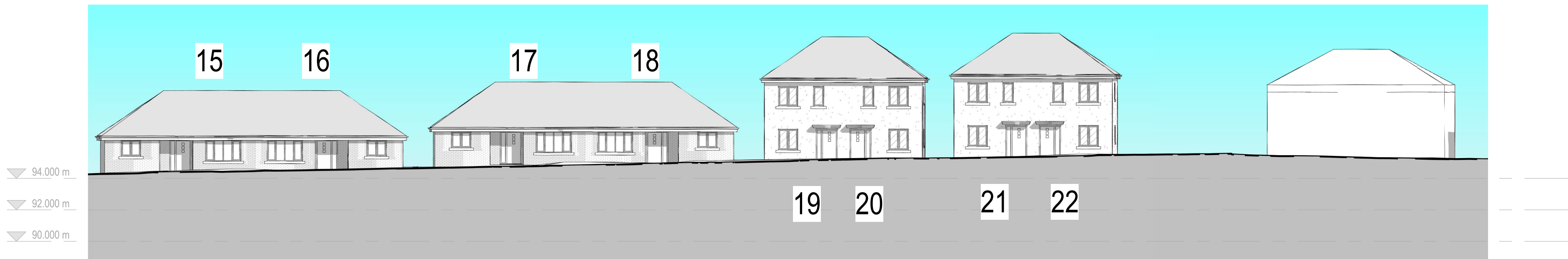
Elevation C 1 : 200